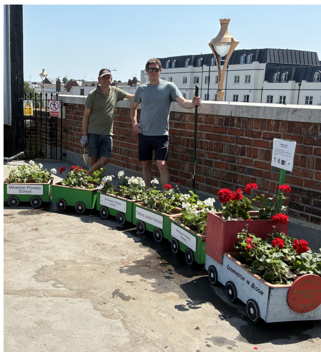
Network Rail Volunteers Day at Leamington Station 19th June, 2025

The Leamington Society has submitted our response to the consultation on the future of Parade. Rather, it was a compilation of opinions, ideas and concerns raised by Committee members and at the event we hosted in July. We are looking forward to the results of the consultation and will update you at the earliest opportunity.