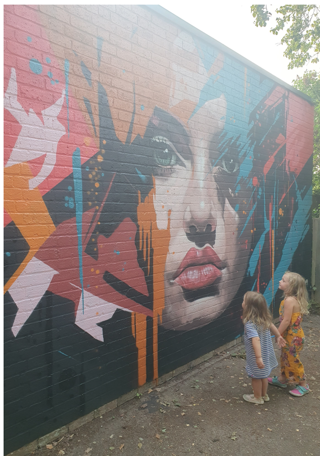
One of the most recent murals by Brink in Acacia Rd.