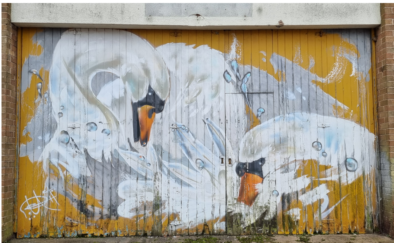
One of the endangered murals: 'Swans' by Peachzz in Althorpe Street.