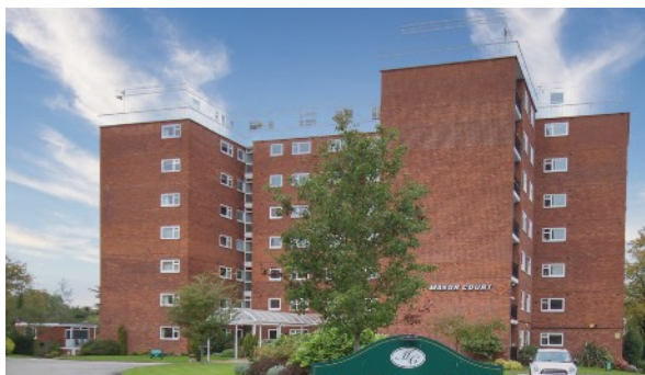
Manor Court in Avenue Road.