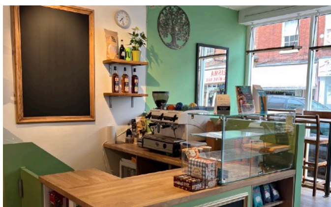
New cafe area opened recently in the organic grocery store Core at 50 Regent Street

At the same time, the rise of online shopping has made it harder for high streets to thrive, leading to more empty shop fronts and reduced footfall. But coffee shops bring something the digital world can't: real, human connection. They turn vacant units into vibrant community hubs and help re-anchor our town centres around experiences, not just transactions. In this way, cafés are playing an increasingly important role in revitalising local economies and giving people a reason to come back to the high street.