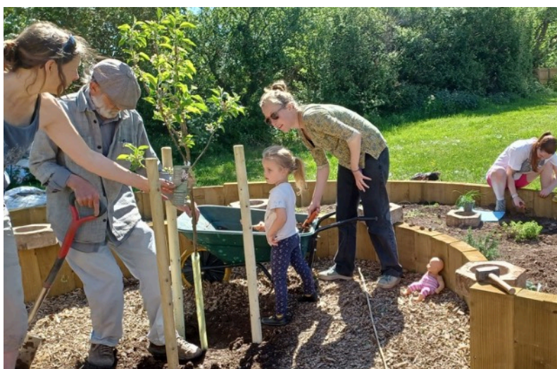
Crest Community Gardening.

Visit arccic.co.uk to find out more about us.