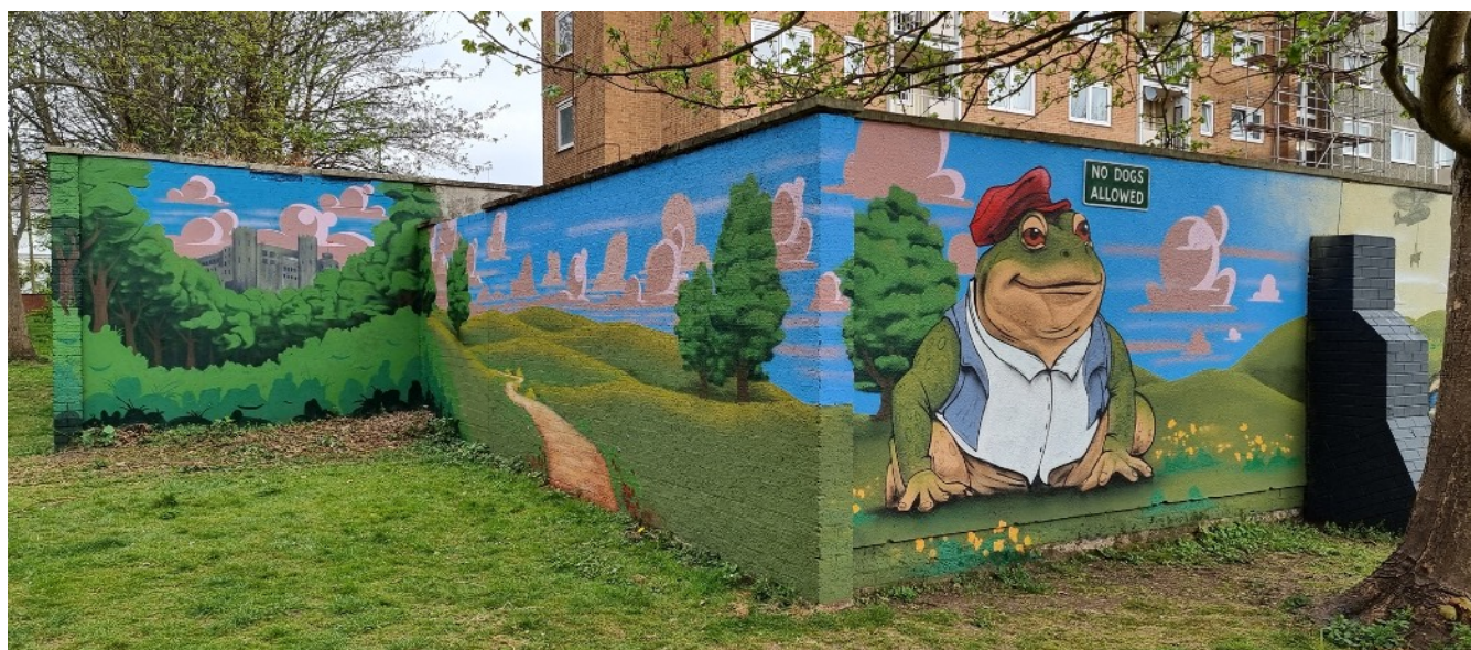
Murals in Strathearn Gardens. Designed and produced by Brink Contemporary Arts. Inspired by suggestions from year 5 & 6 pupils attending Milverton Primary school. Part funded by Warwickshire County Council, Art Friends Warwickshire and kind donations from supporters of Leamington Mural Festival.

The Leamington Society is a registered charity. It is a member of the West Midlands Amenity Societies Association and the National Organisation of Residents' Associations. We are working with others to enhance the built and green environment of our town whilst supporting new developments to improve the quality of life locally.