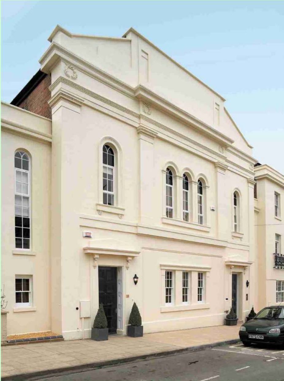
Chapel Court, Portland St/ Windsor St