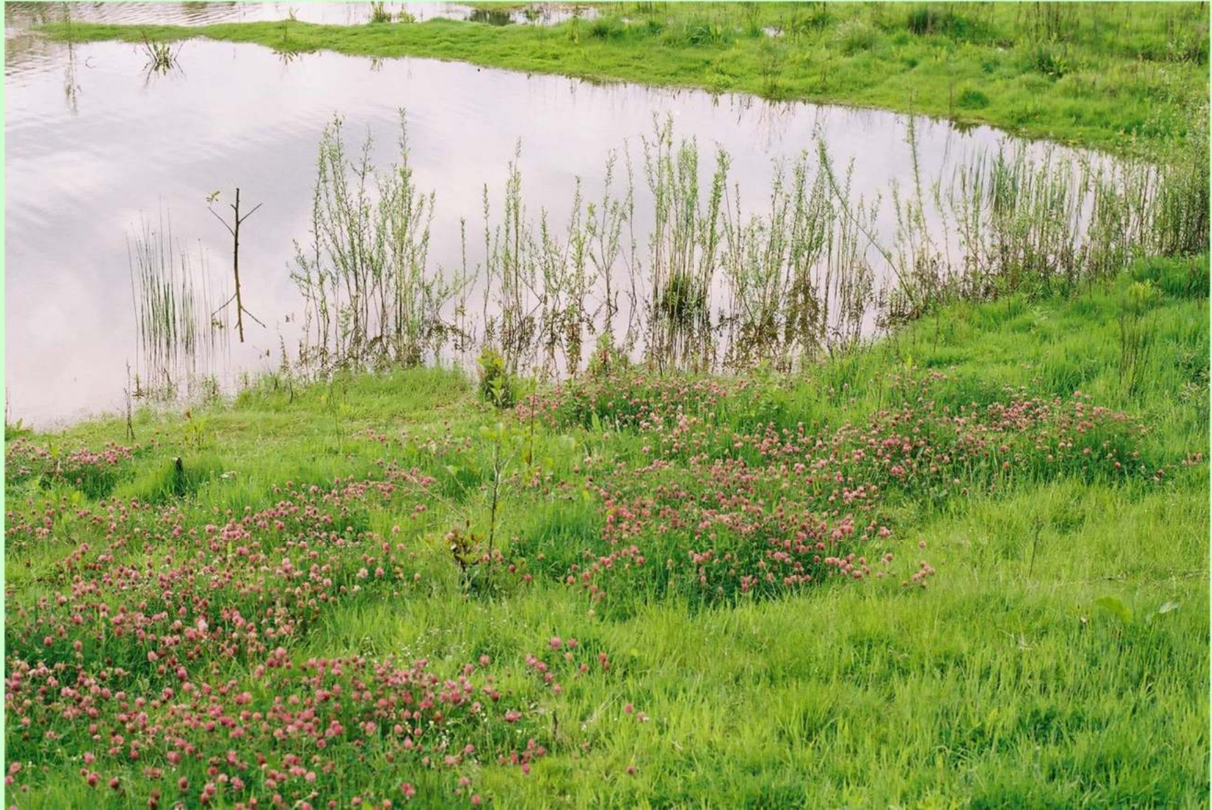
Wetlands Nature Reserve, Newbold Comyn