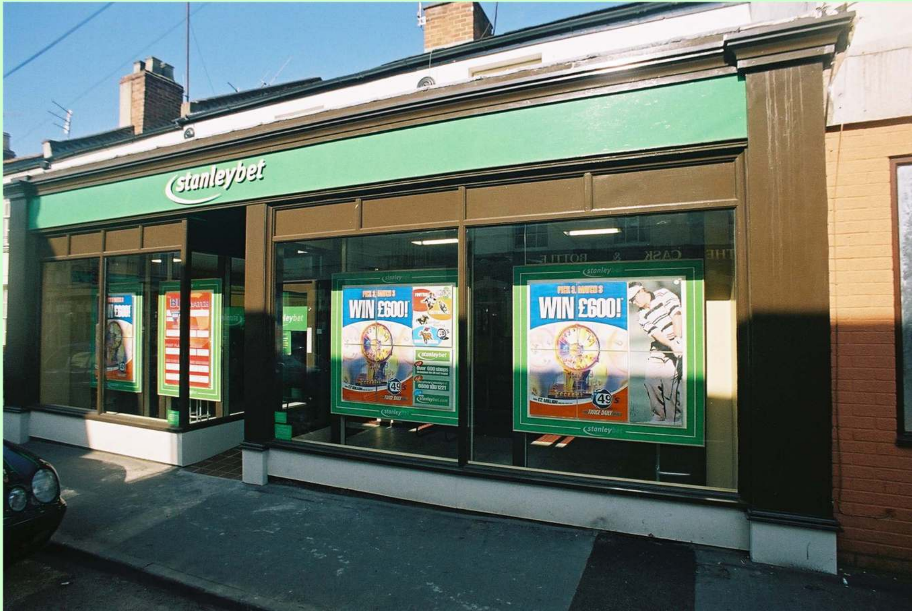
Stanleybet, 20 – 22 Lansdown St