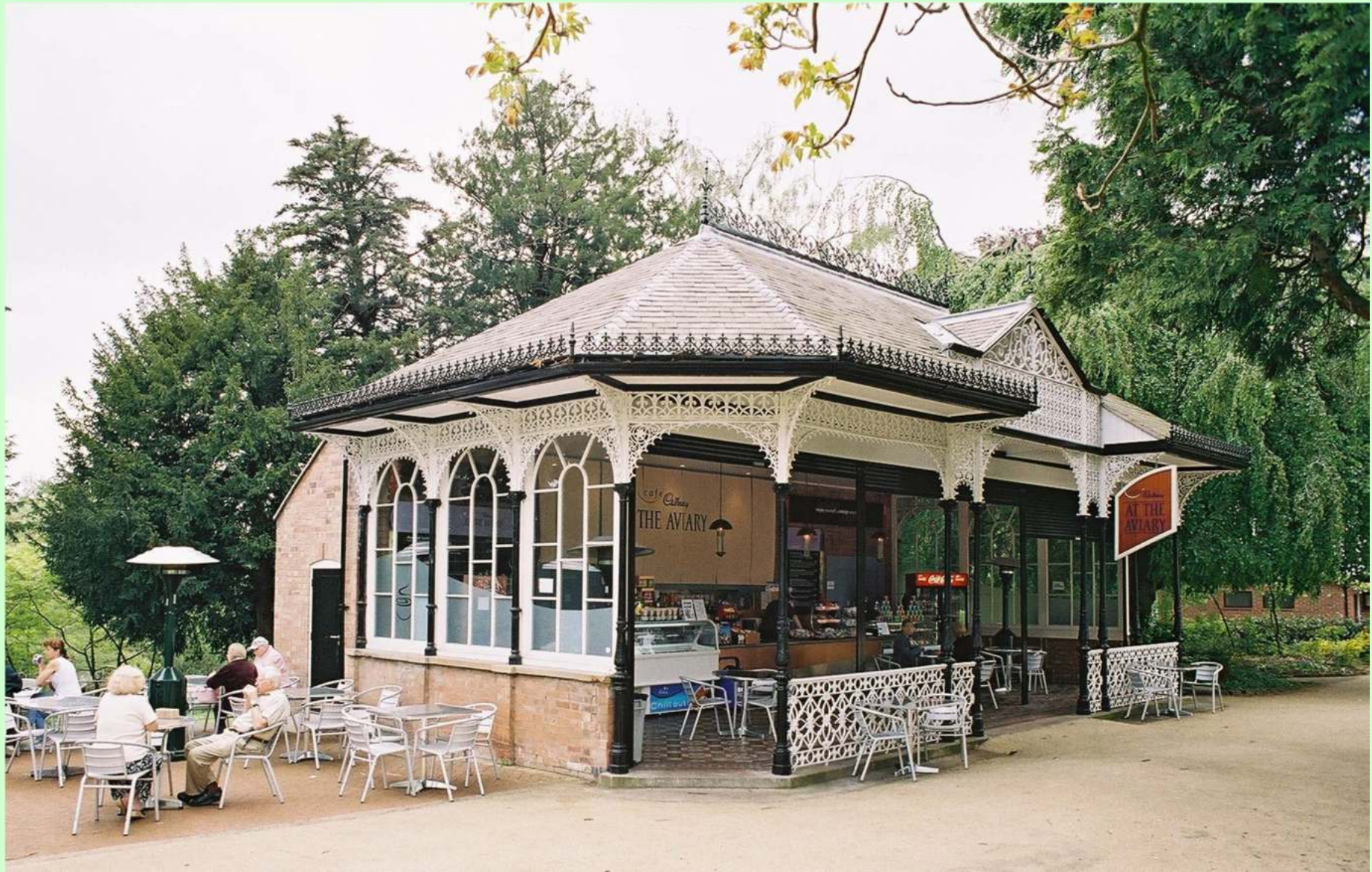
The Aviary, Jephson Gardens