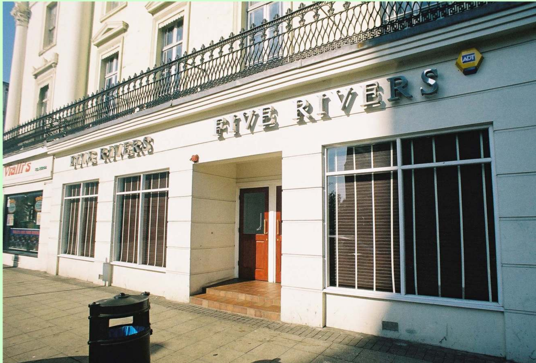
Five Rivers, 20 -22 Victoria Terrace