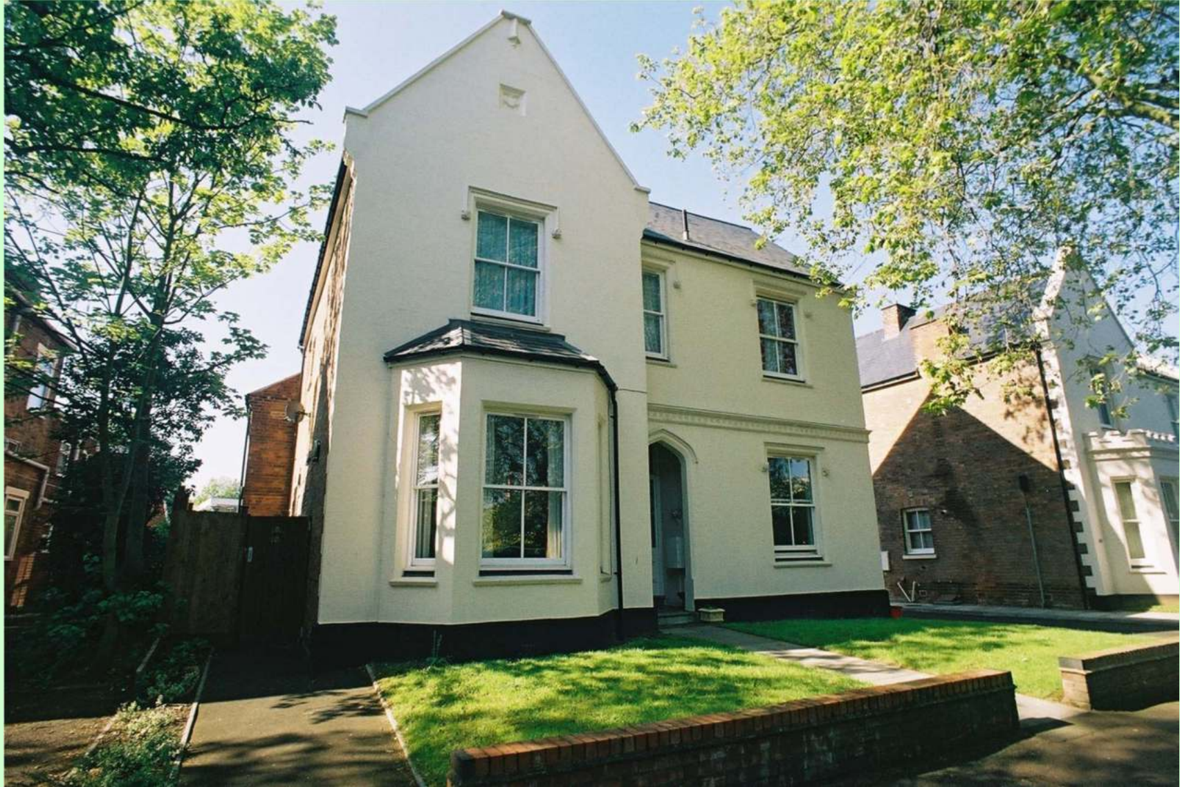
19, 21 Avenue Road