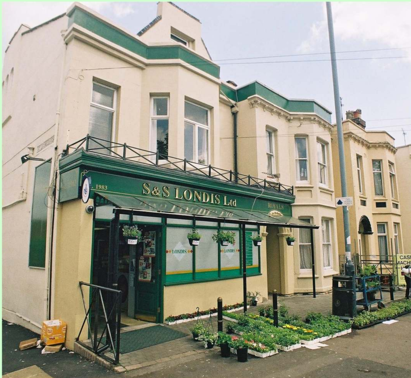
S & S Londis, 143 Tachbrook Rd