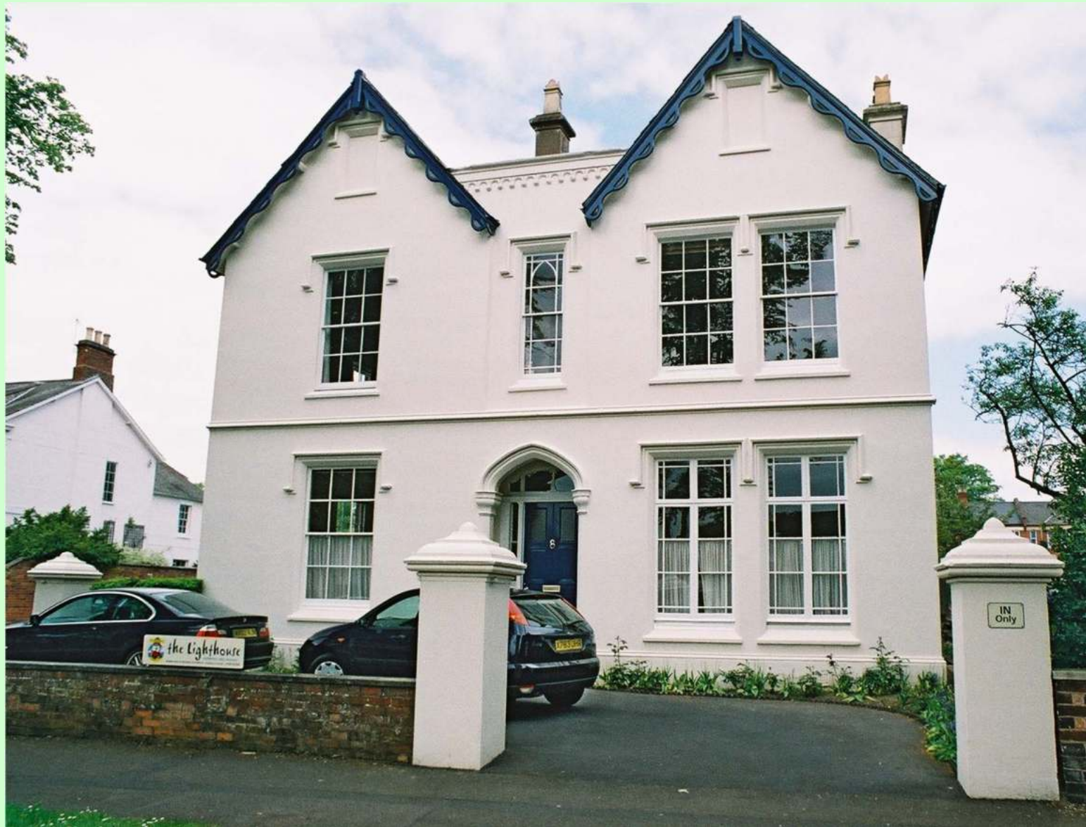
Seaforth House, 8 Warwick New Rd