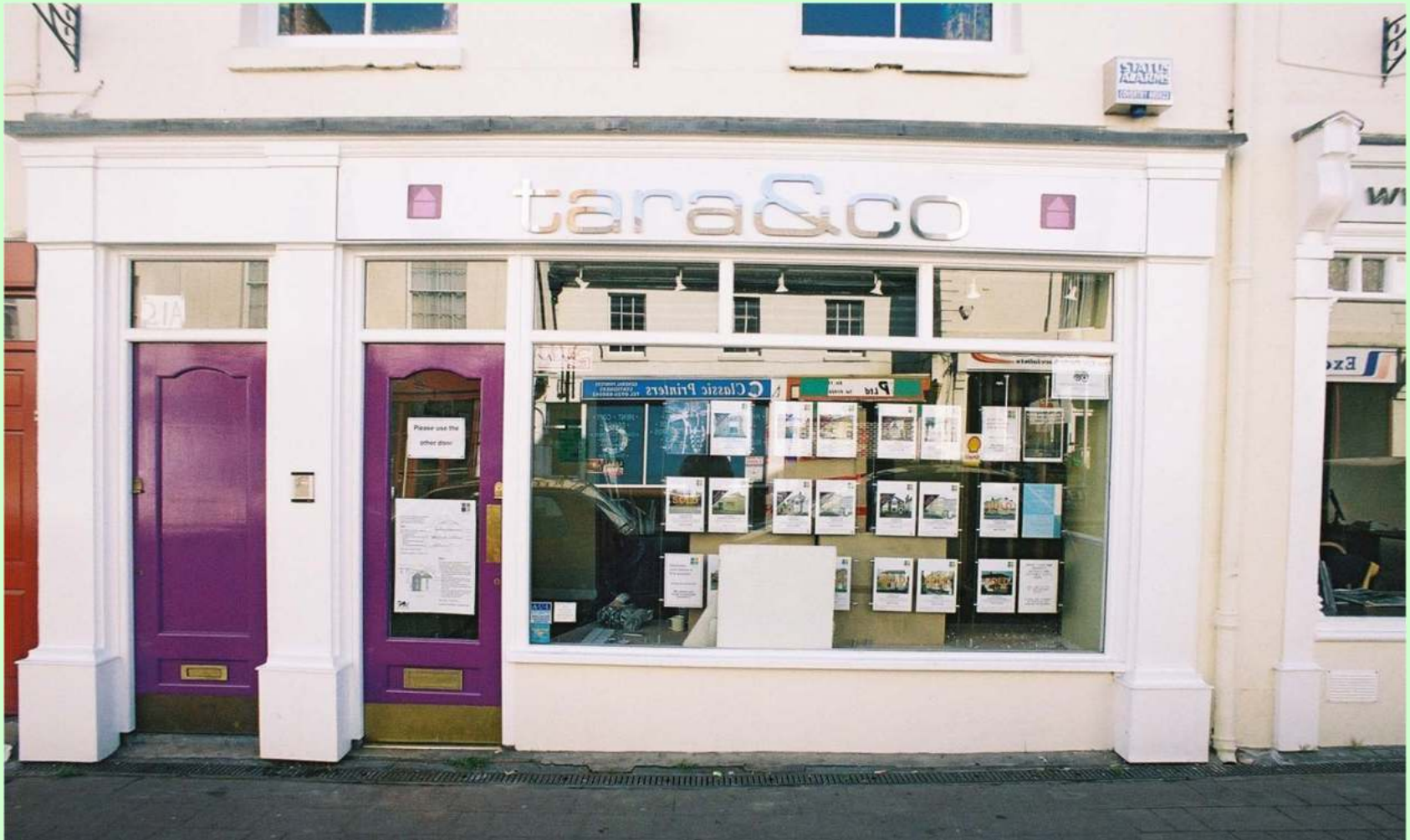
Tara & Co, 21 Clemens St