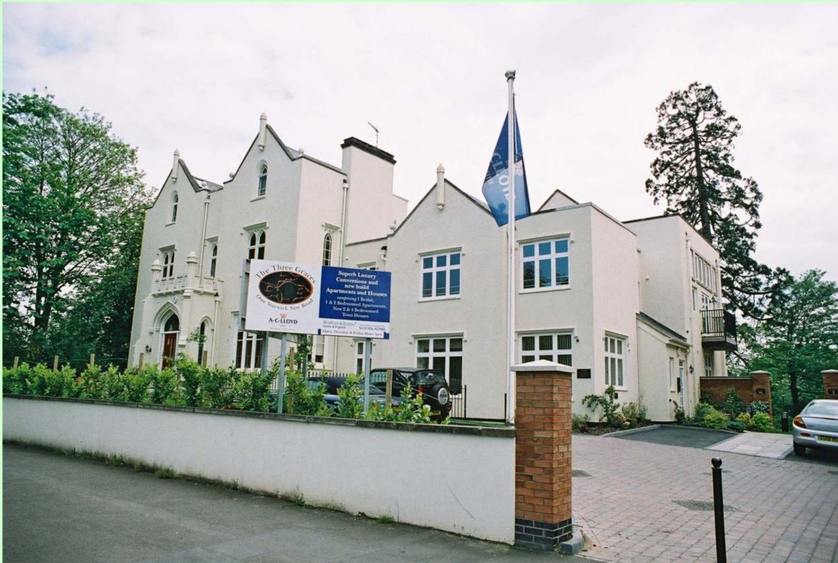
The Three Graces, 1 Warwick New Road