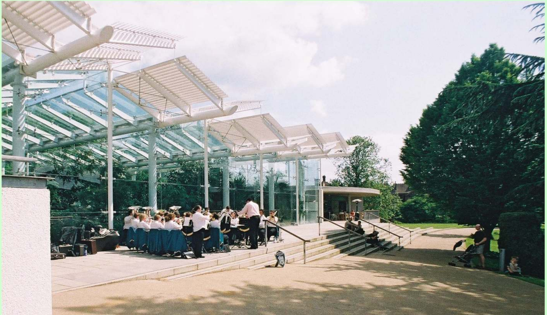
Temperate House, Jephson Gardens