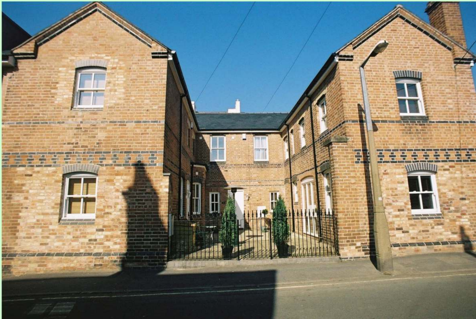
2a, 2b and 2c Morrell St