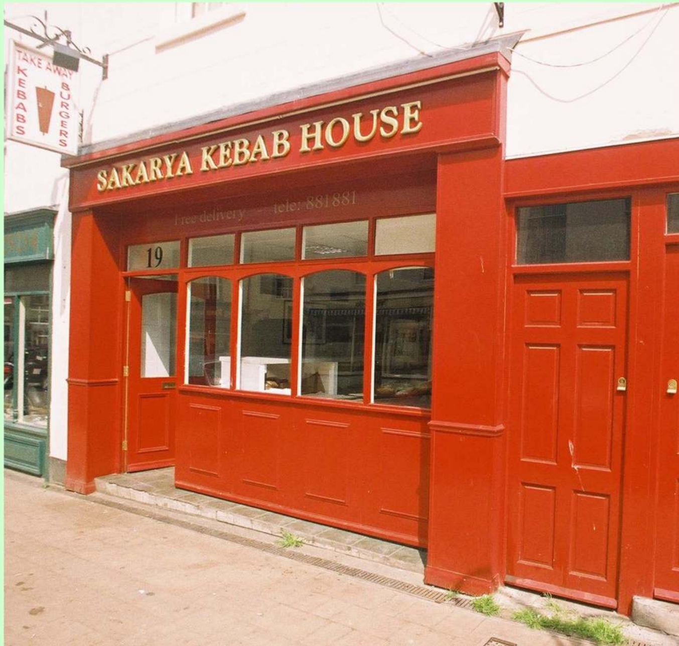
Sakarya Kebab House, 19 Clemens St