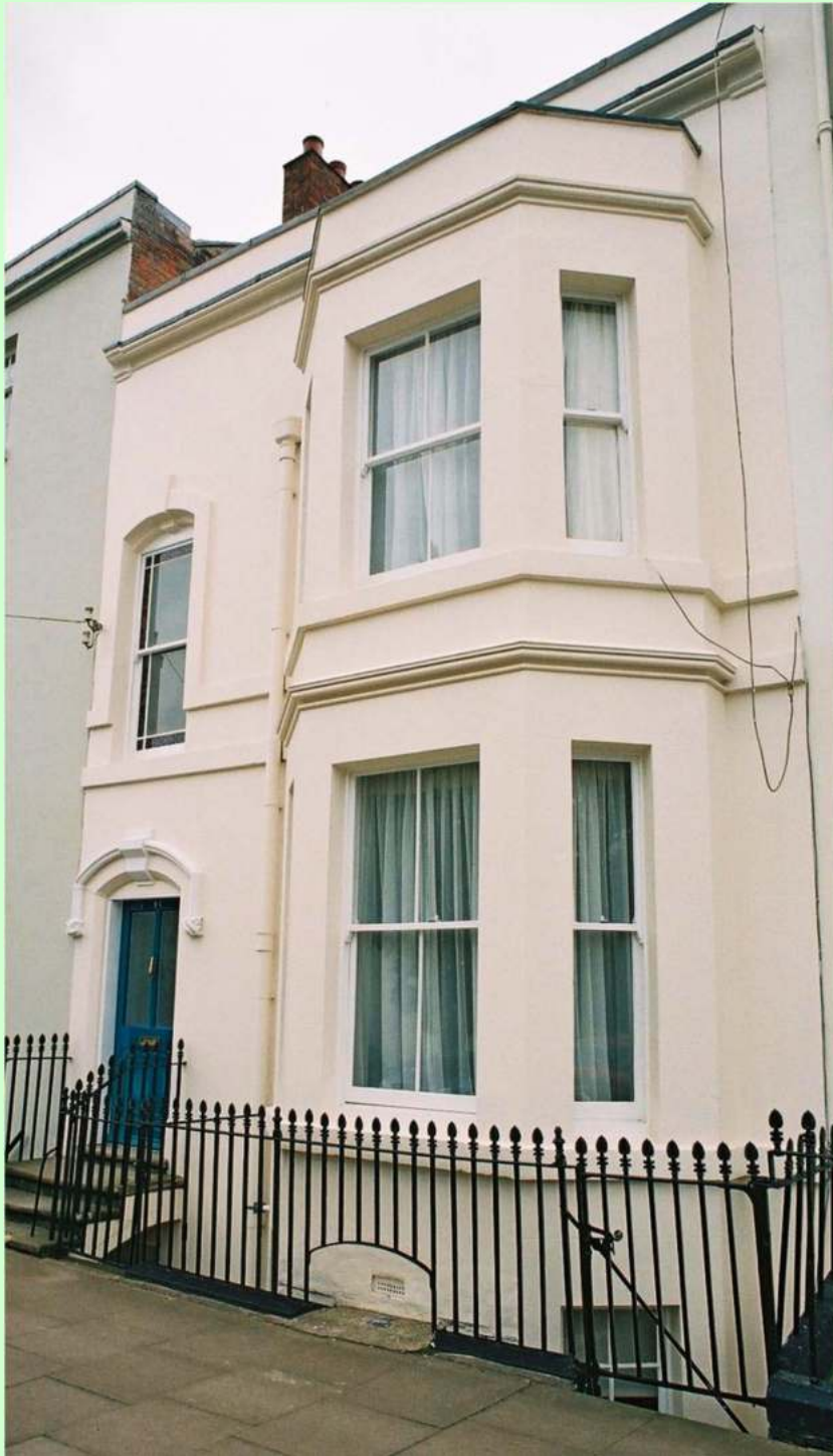
24 Portland Place West