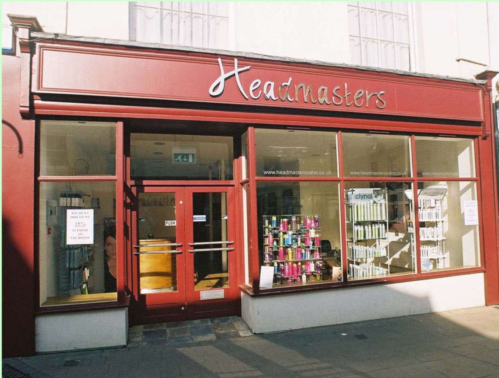
Headmasters, 26 Clemens St