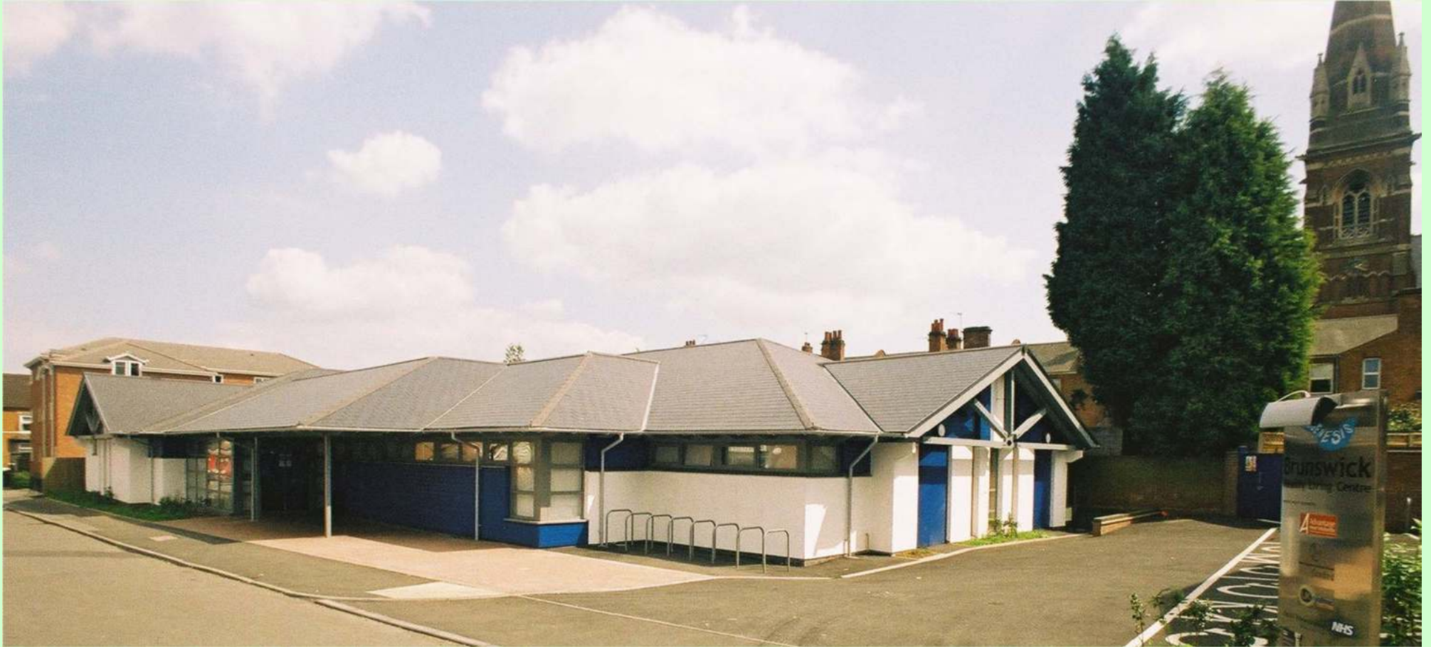
Healthy Living Centre, Shrubland St