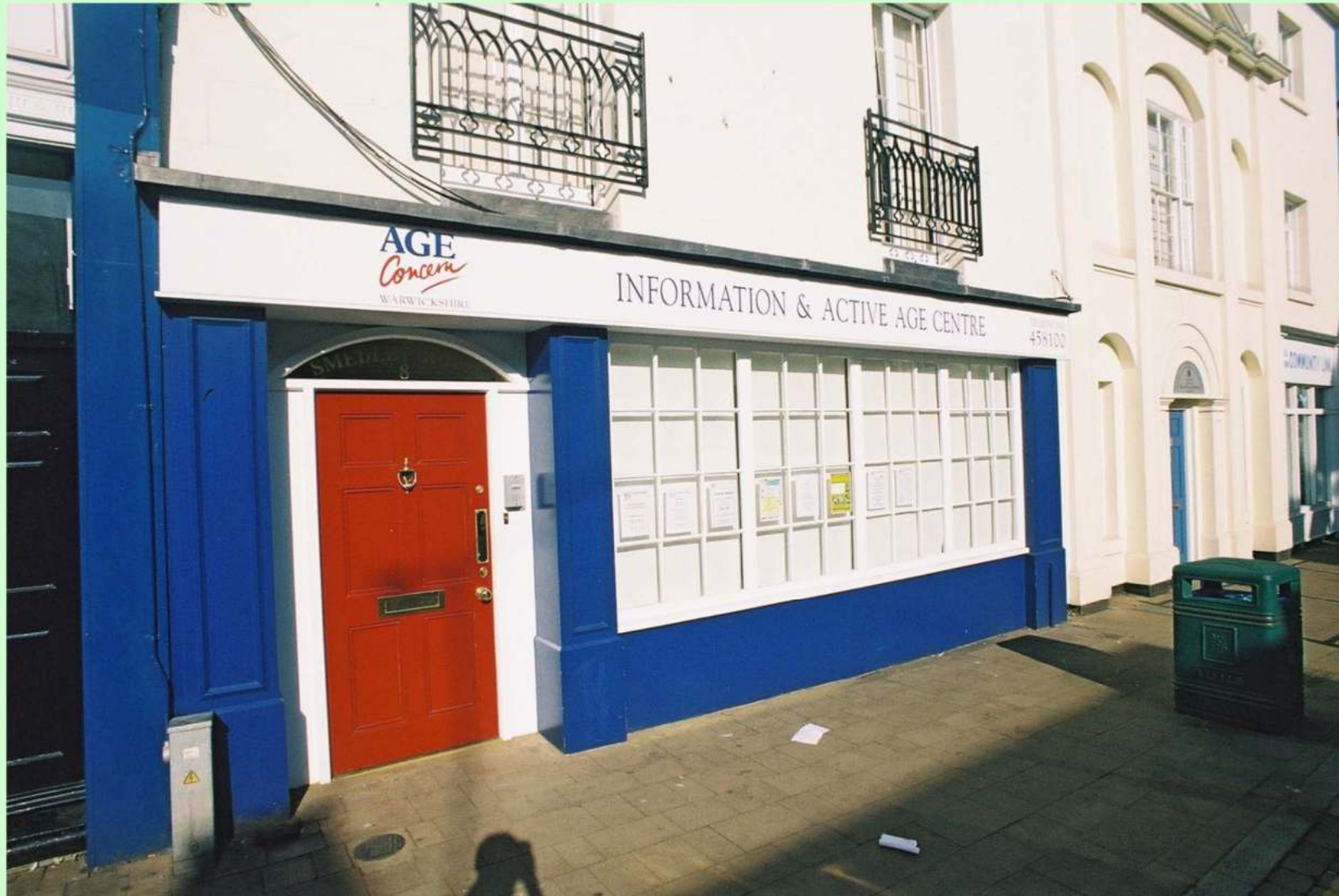
Age Concern, 8 Clemens St