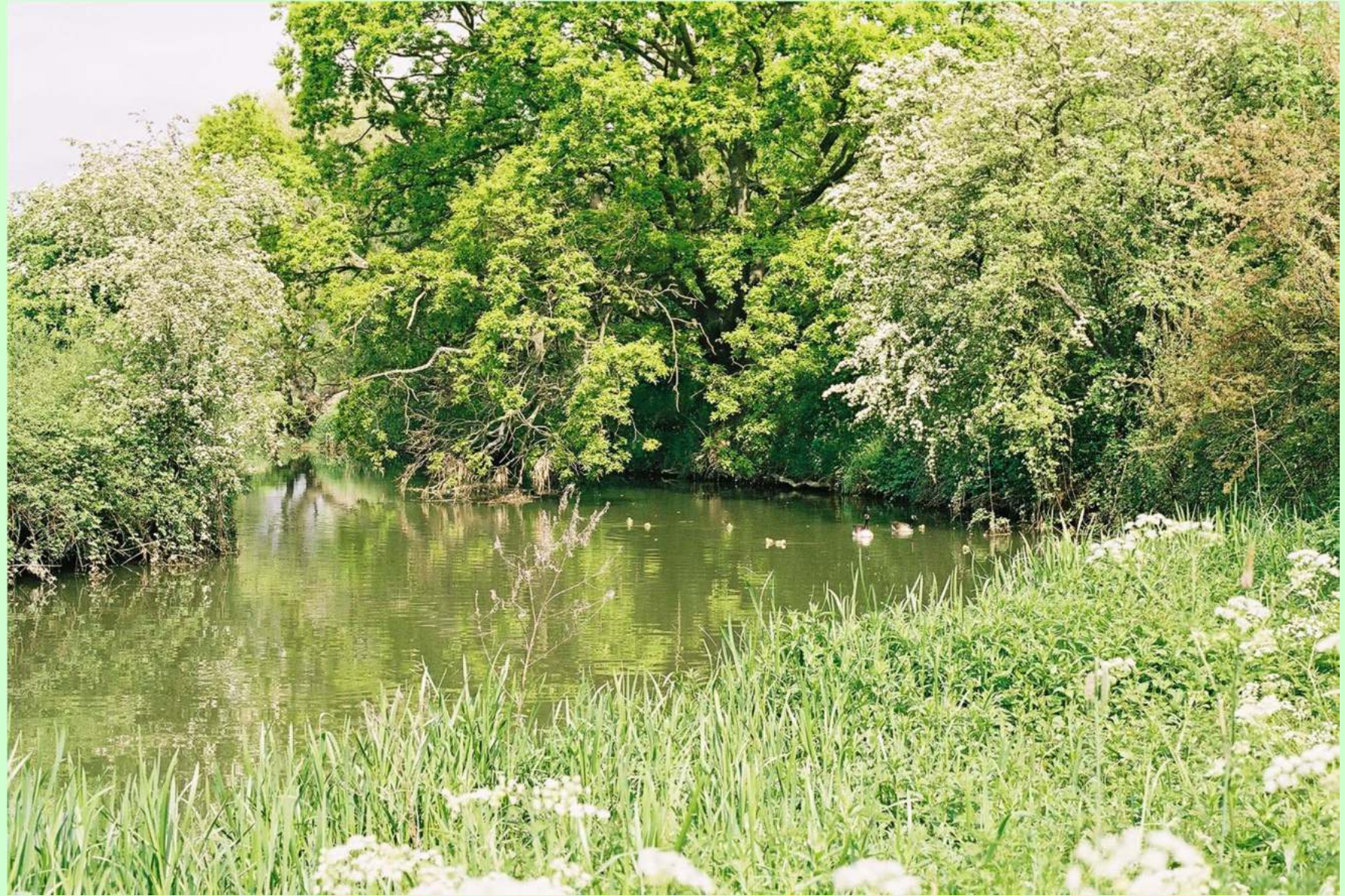
Wetlands Nature Reserve, Newbold Comyn