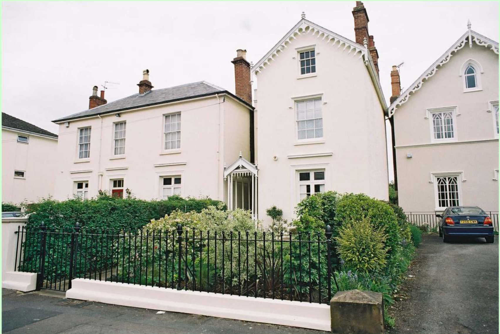
7 Leam Terrace