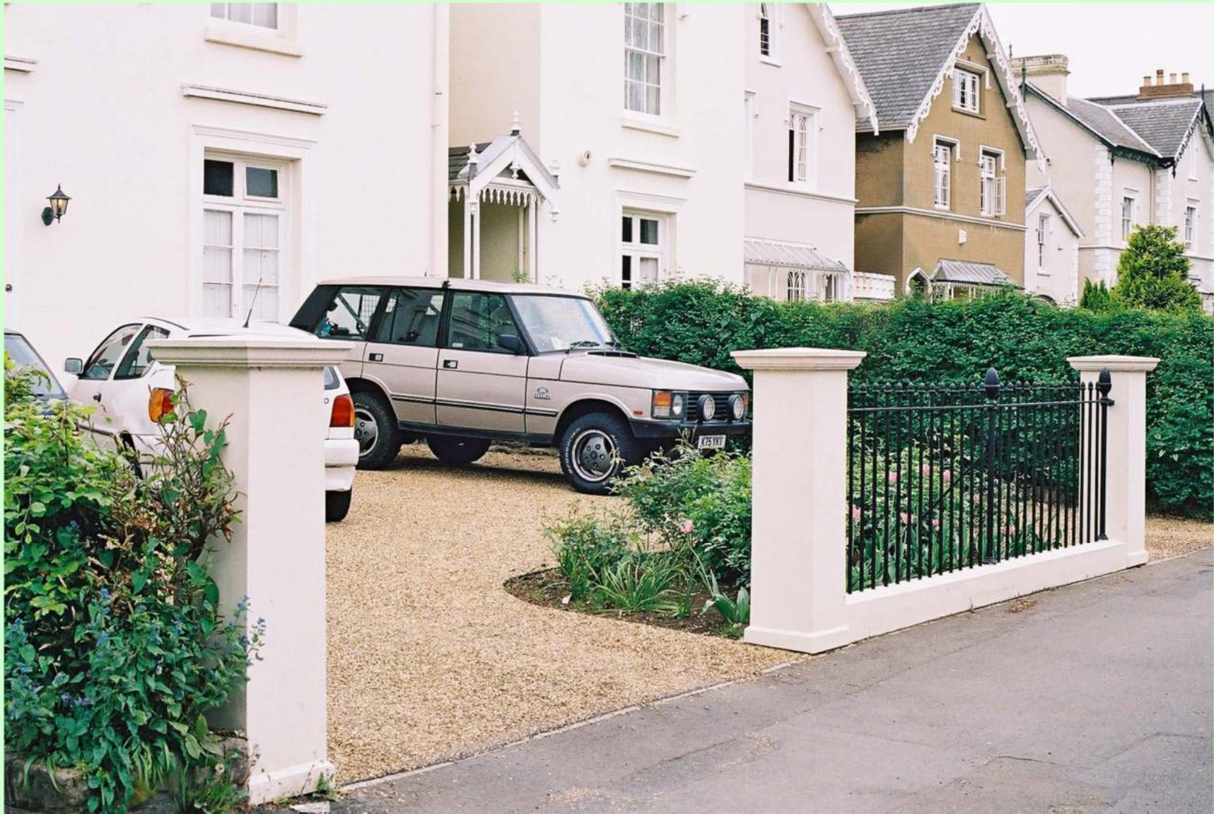
5 Leam Terrace