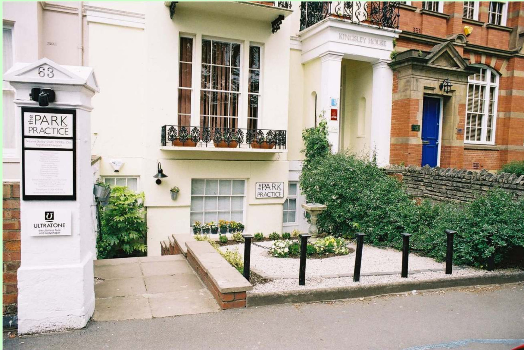
Parkside Practice, 63 Holly Walk