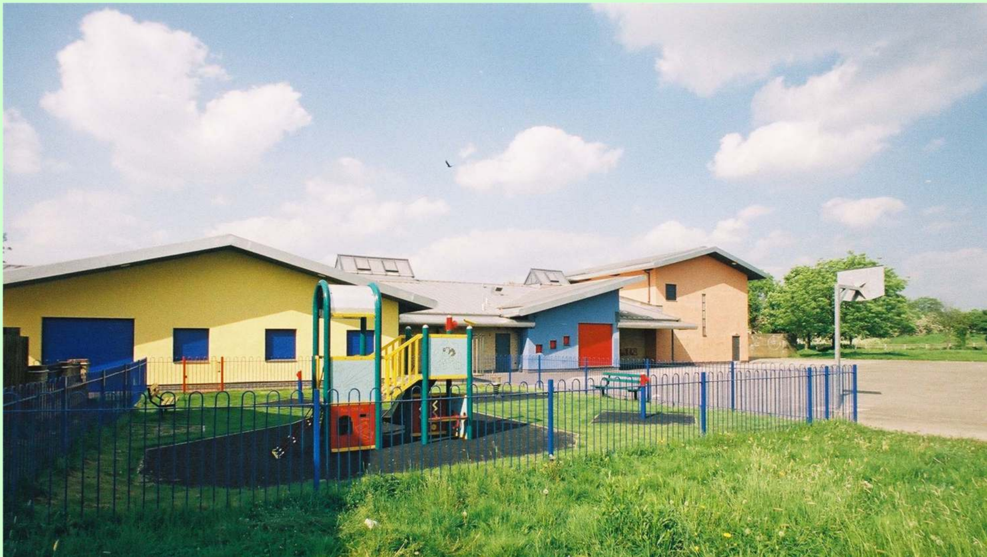
SYDNI Centre, Sydenham