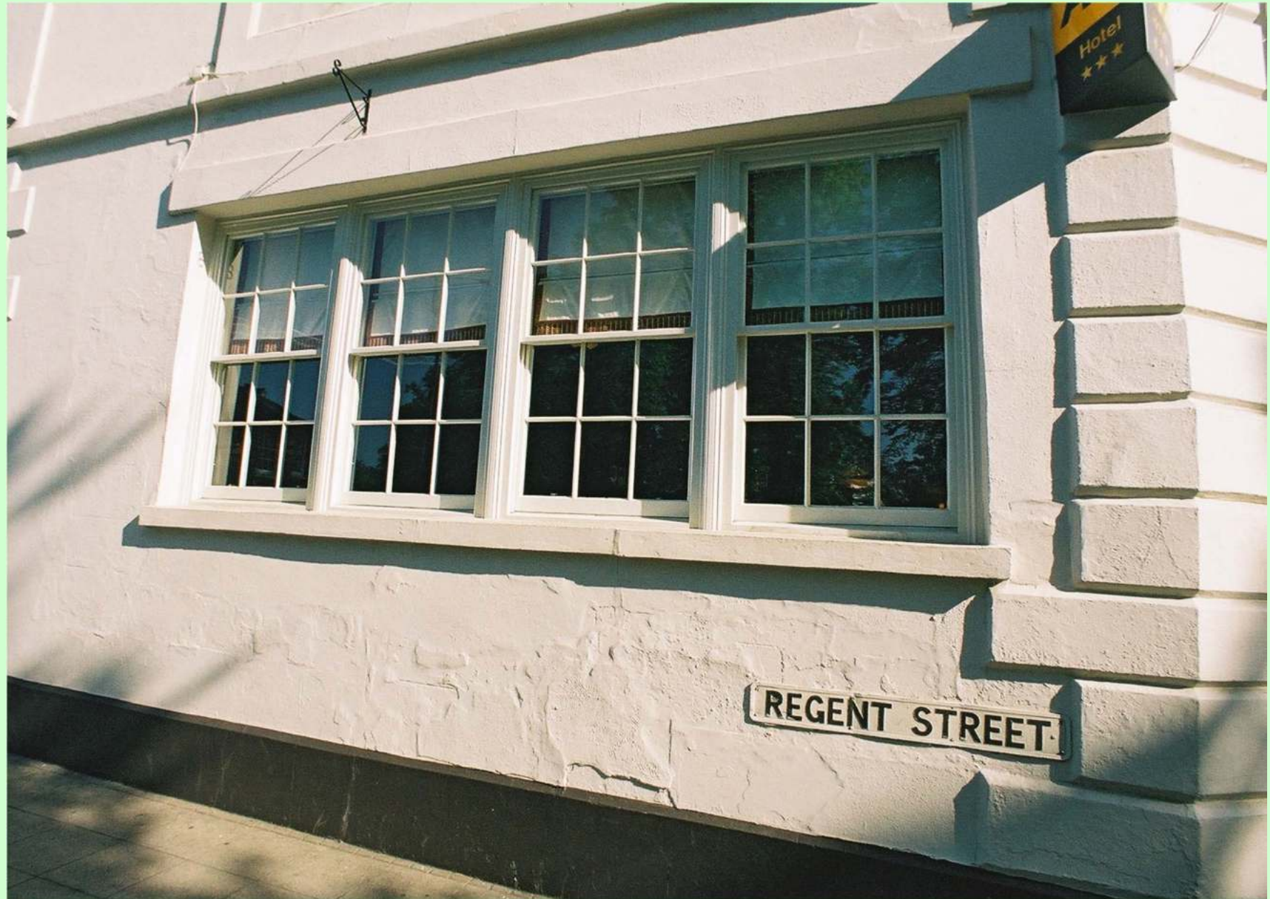
Angel Hotel, Regent St