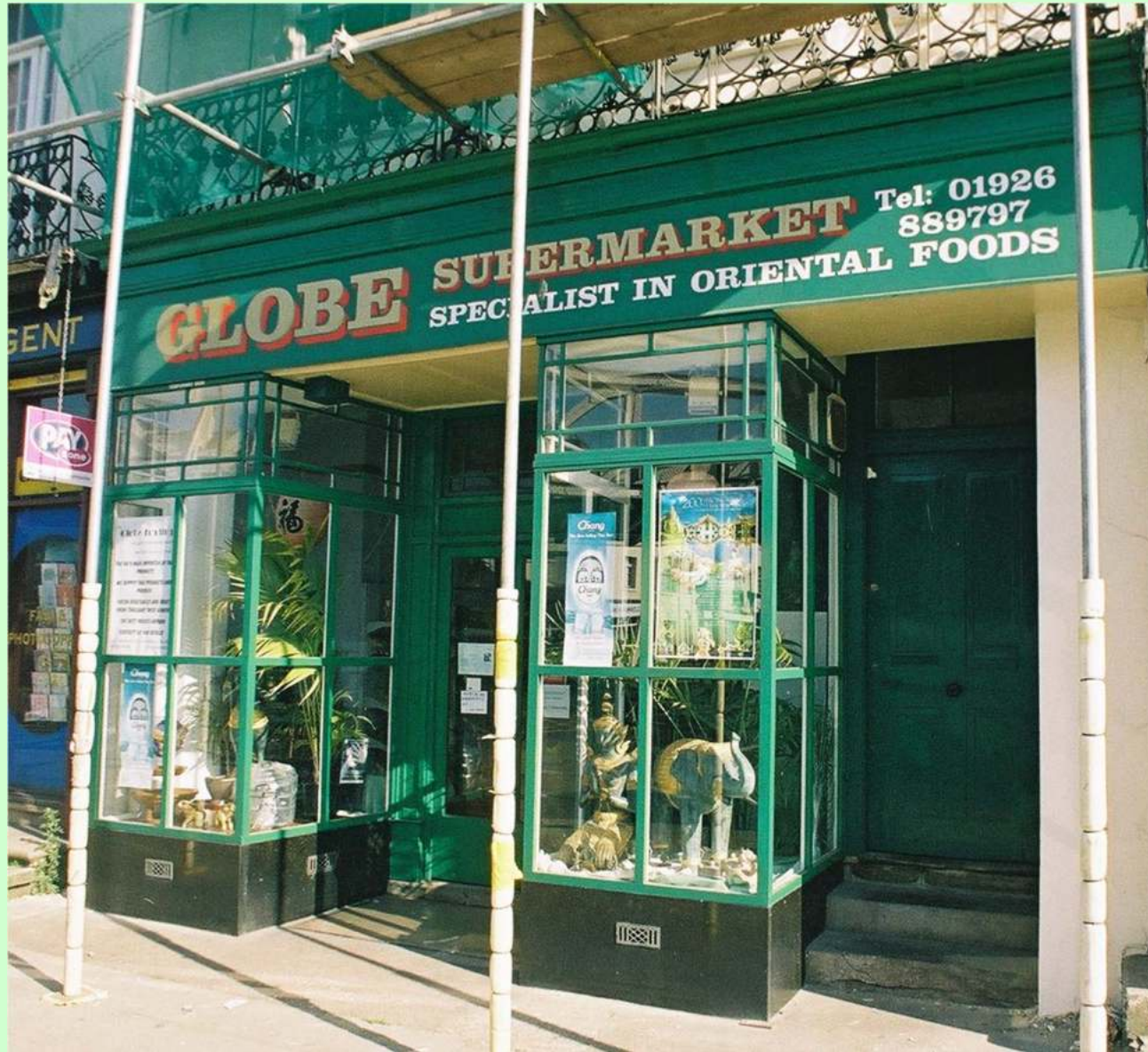
Globe Supermarket, 23 High St