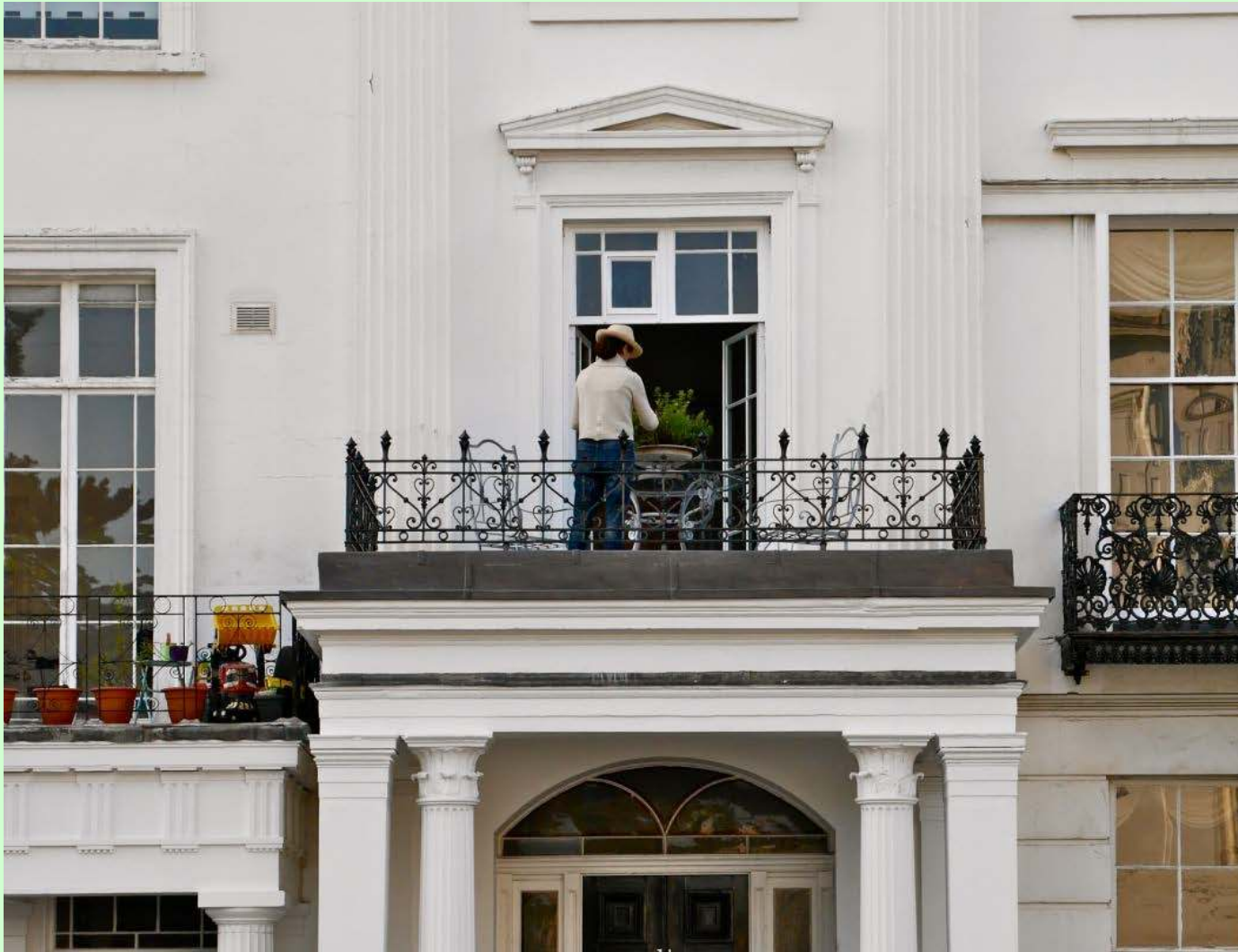
Balcony, 31 Clarendon Square