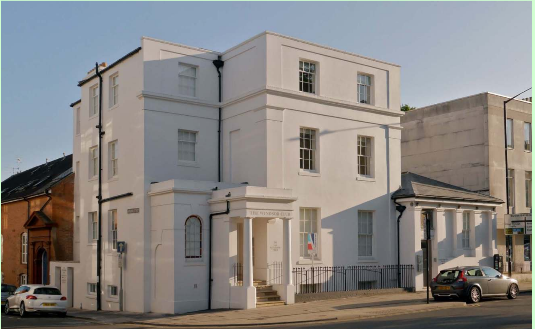
36 Warwick Street