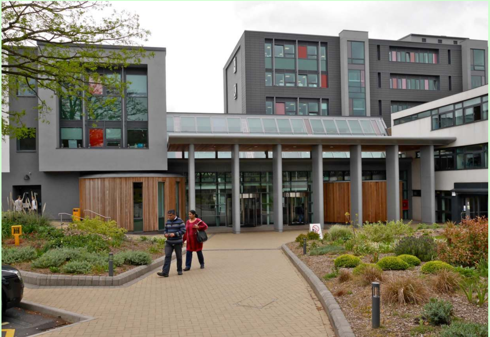
Warwickshire College Foyer