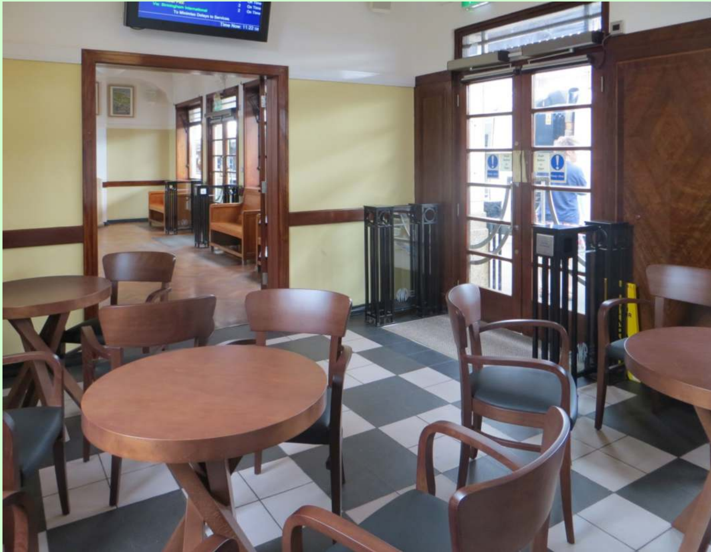
Waiting Room & Refreshment Room, Leamington Station