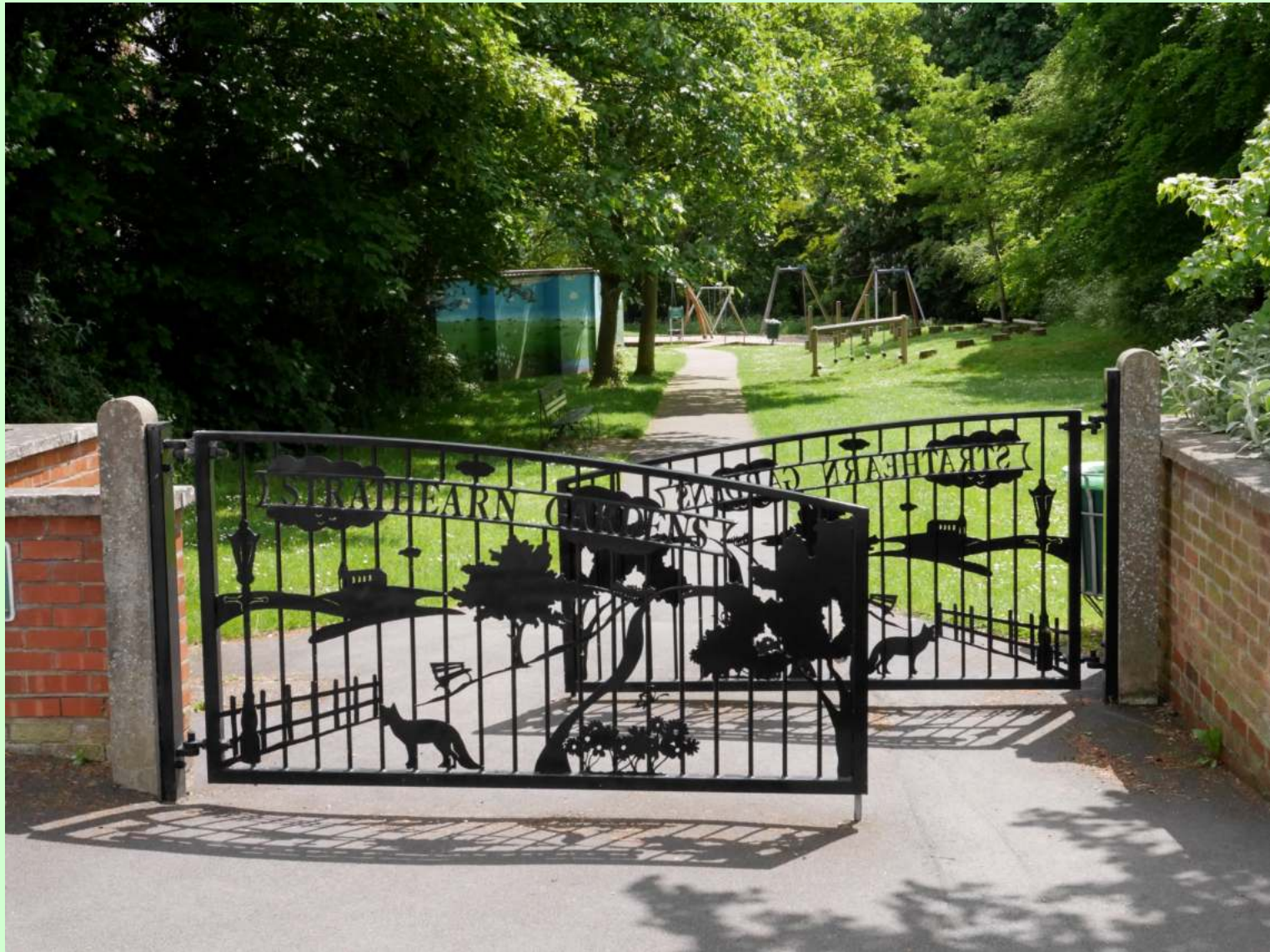
Strathearn Garden Gates, Rugby Road