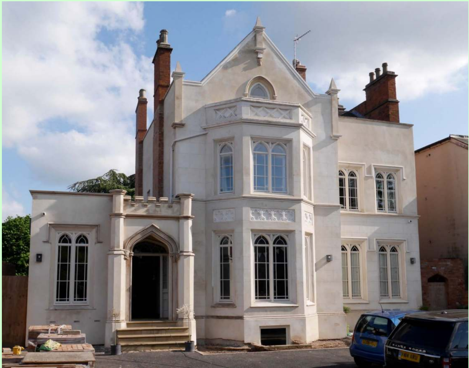
66 Upper Holly Walk