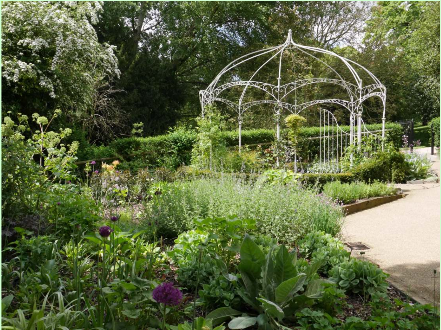
Jephson Gardens, East Lodge Garden