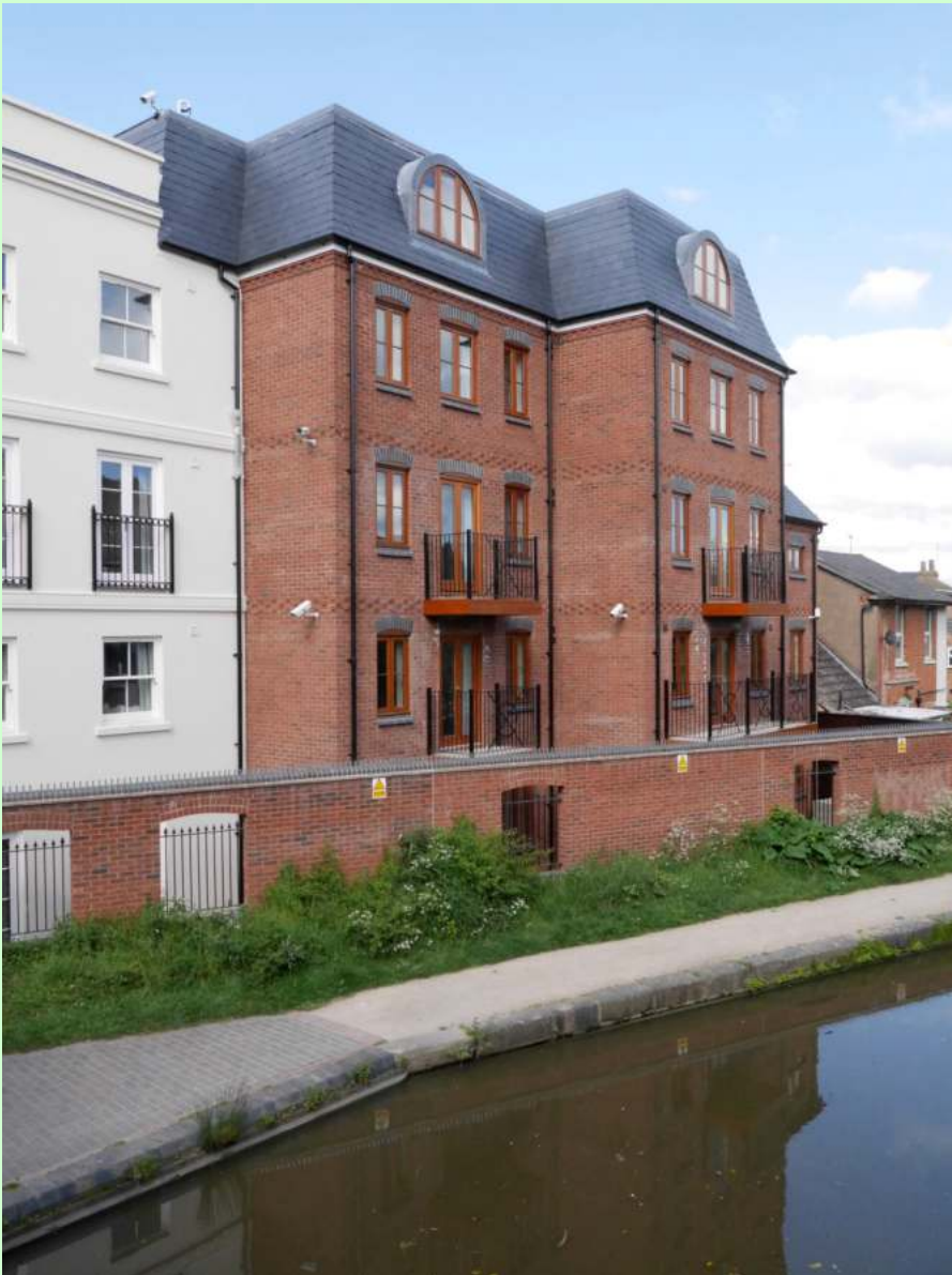
4a Wise Terrace