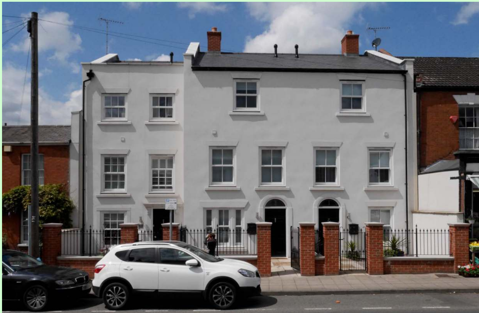
The Mews, Clarendon Street