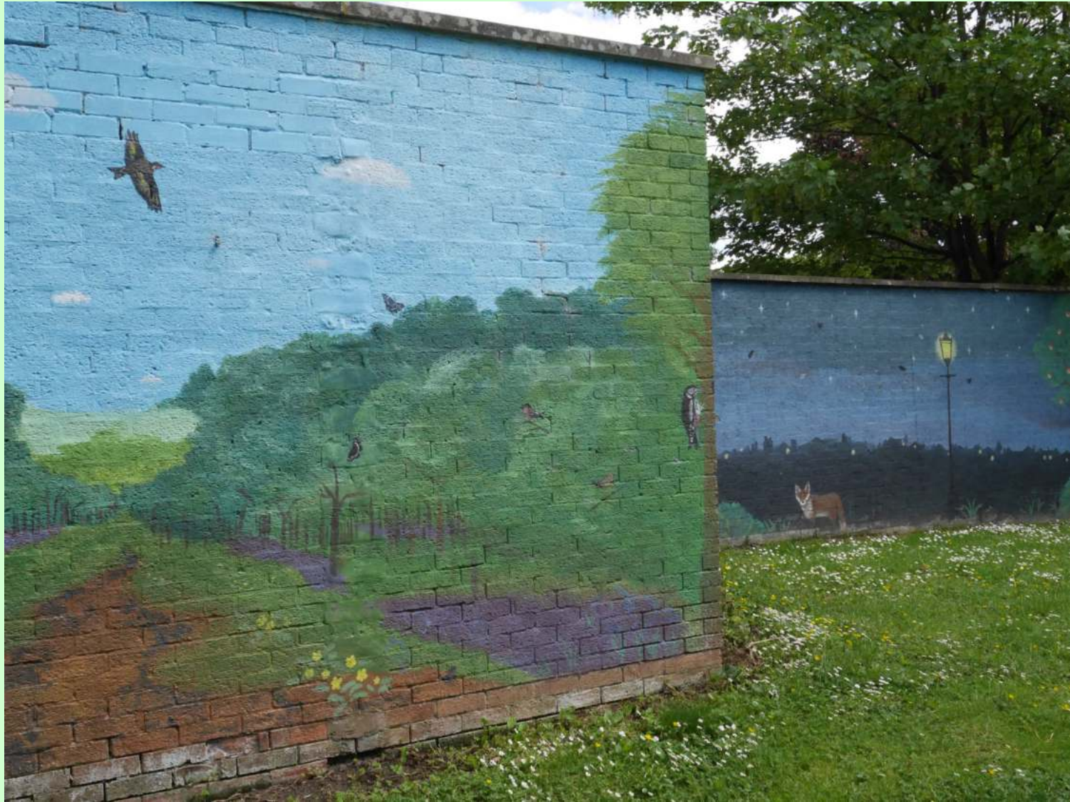
Strathearn Garden Murals, Rugby Road