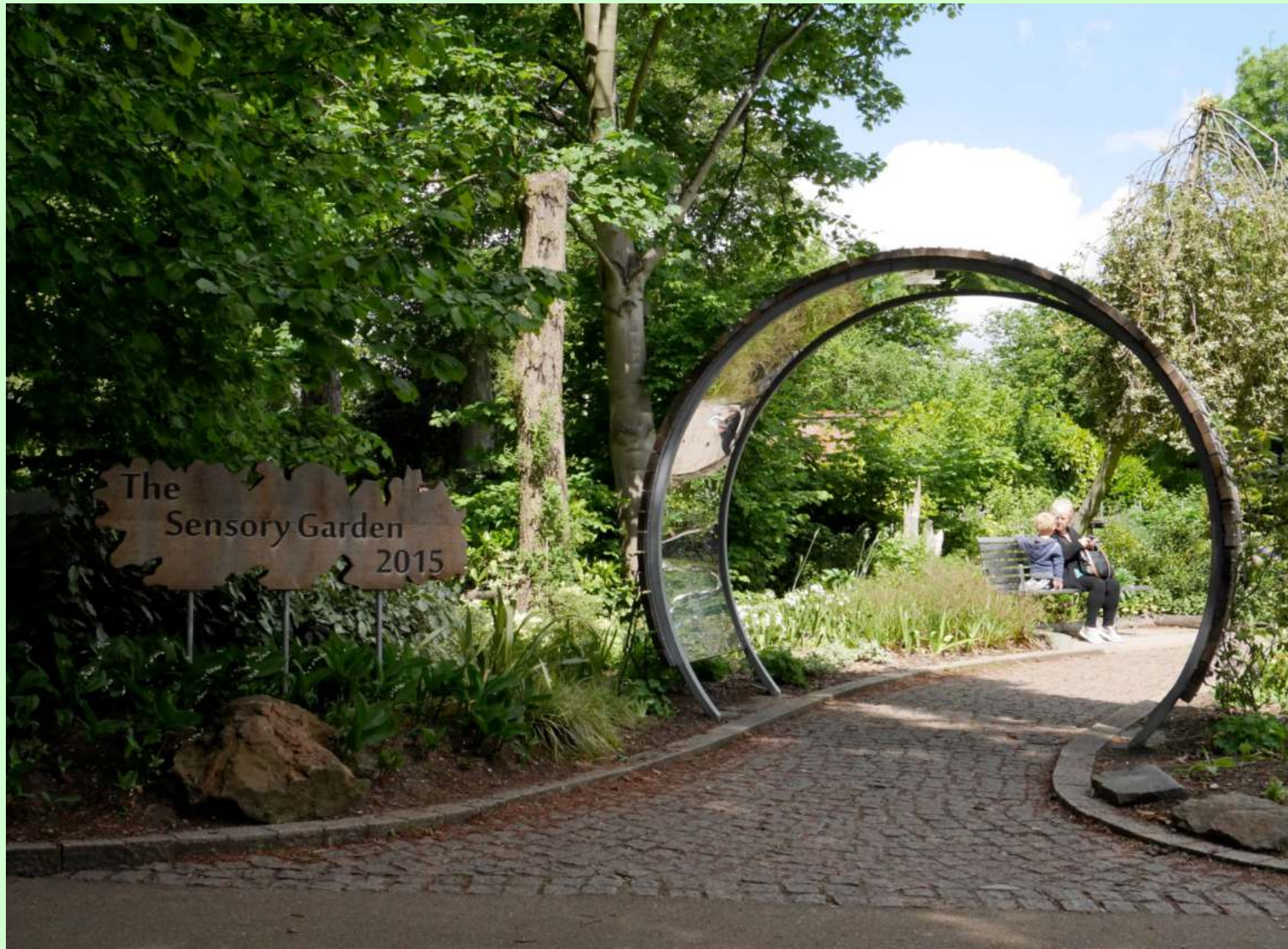
Jephson Gardens Sensory Garden