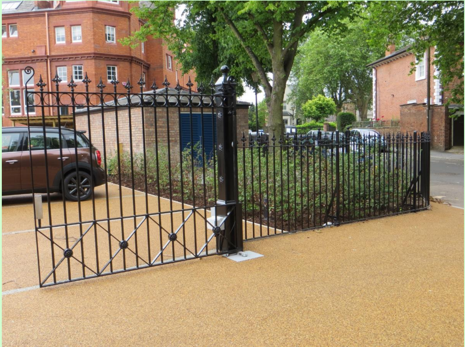
Rear of Old Library, York Road