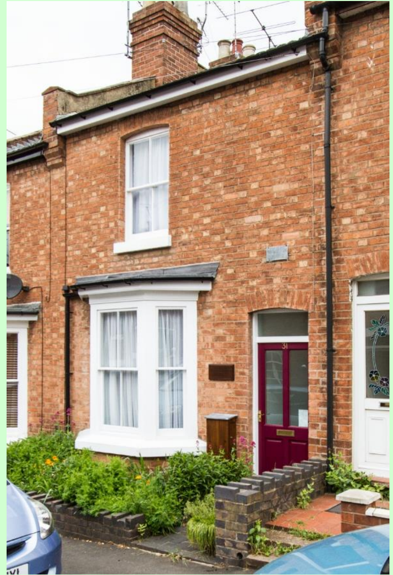
31 North Villiers Street, before and after