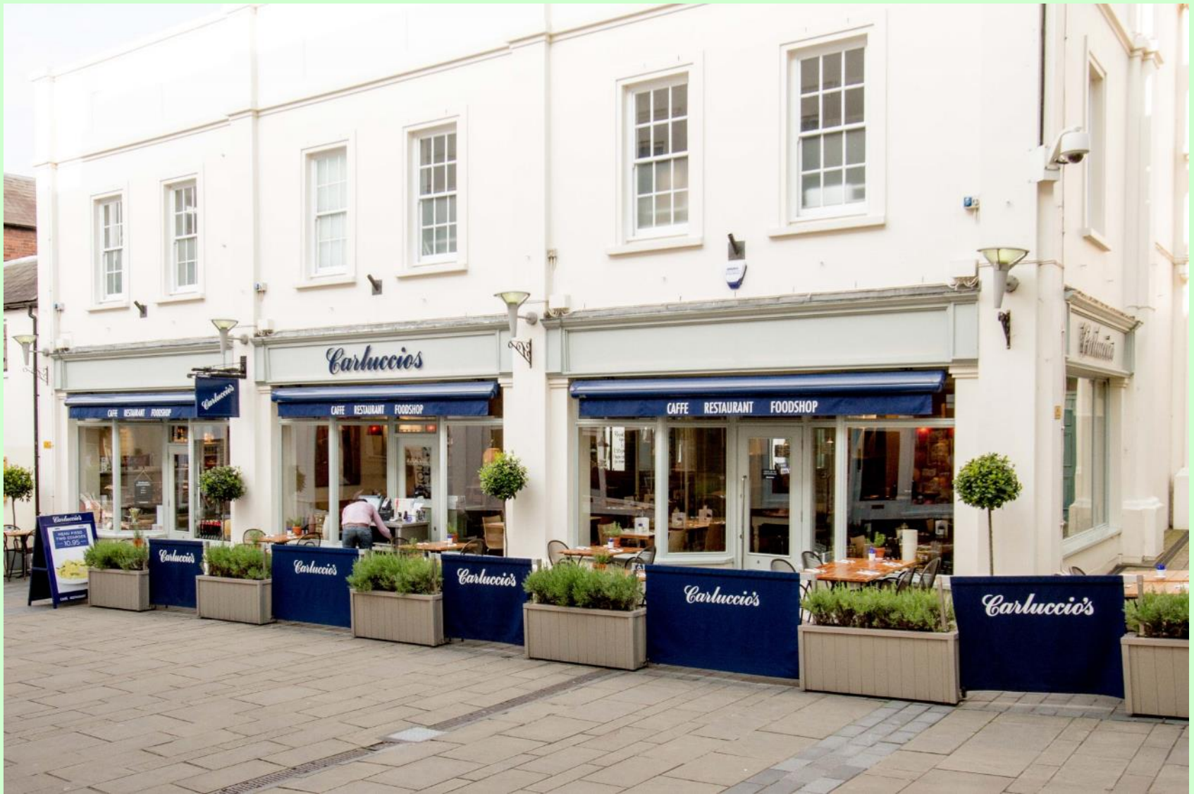
Carluccio's, Satchwell Court