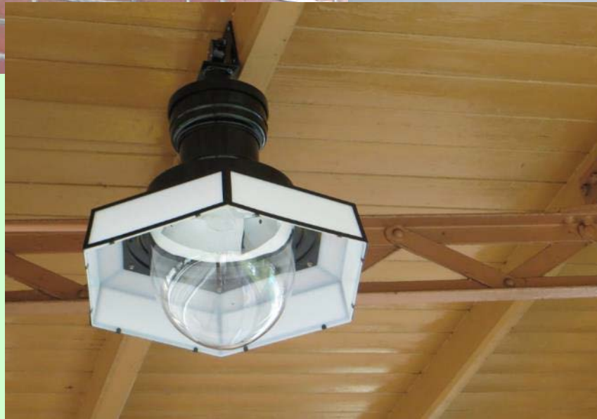
Heritage Lighting at Leamington Station