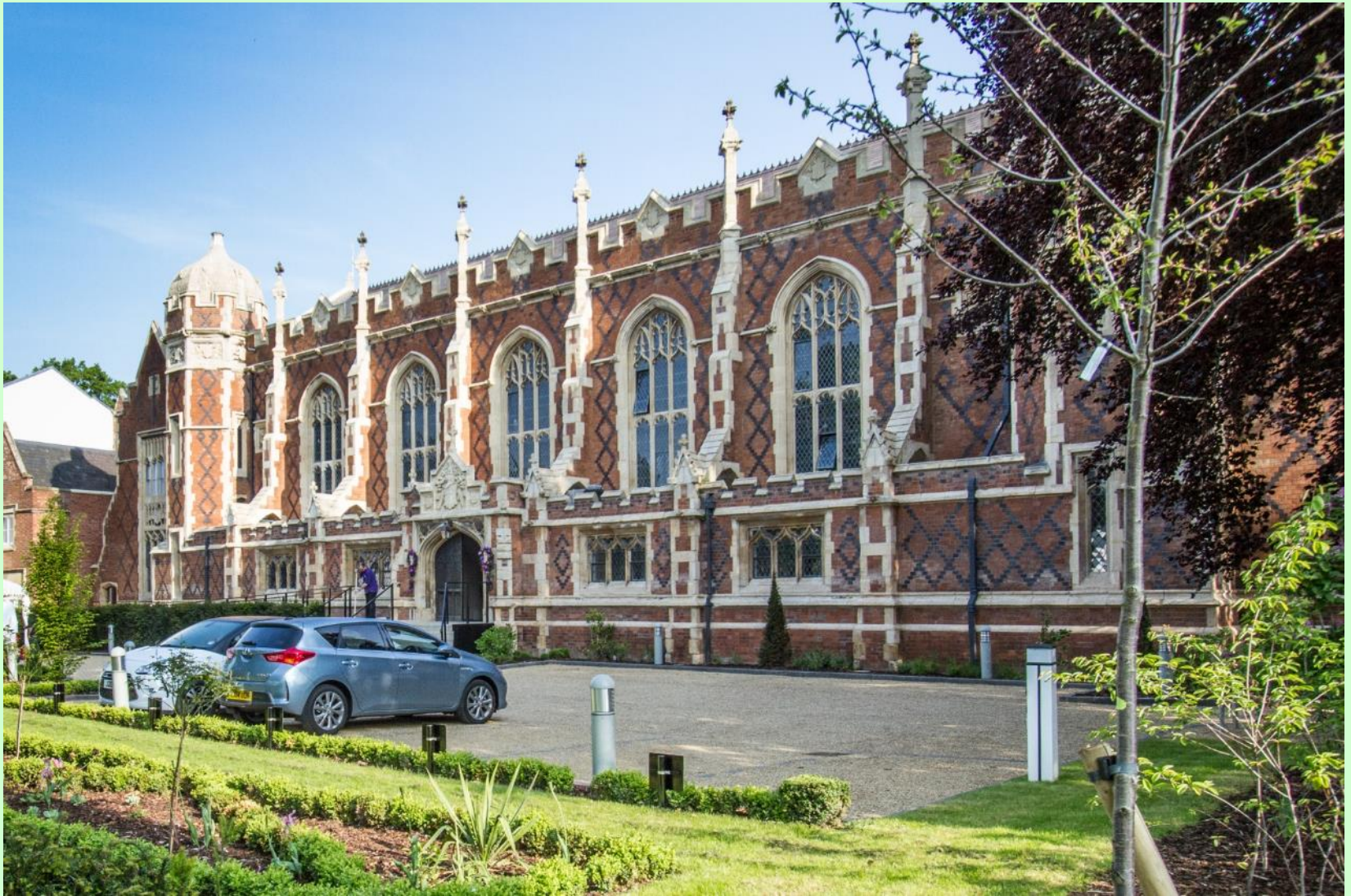
Audley Binswood Retirement Home, Binswood Avenue