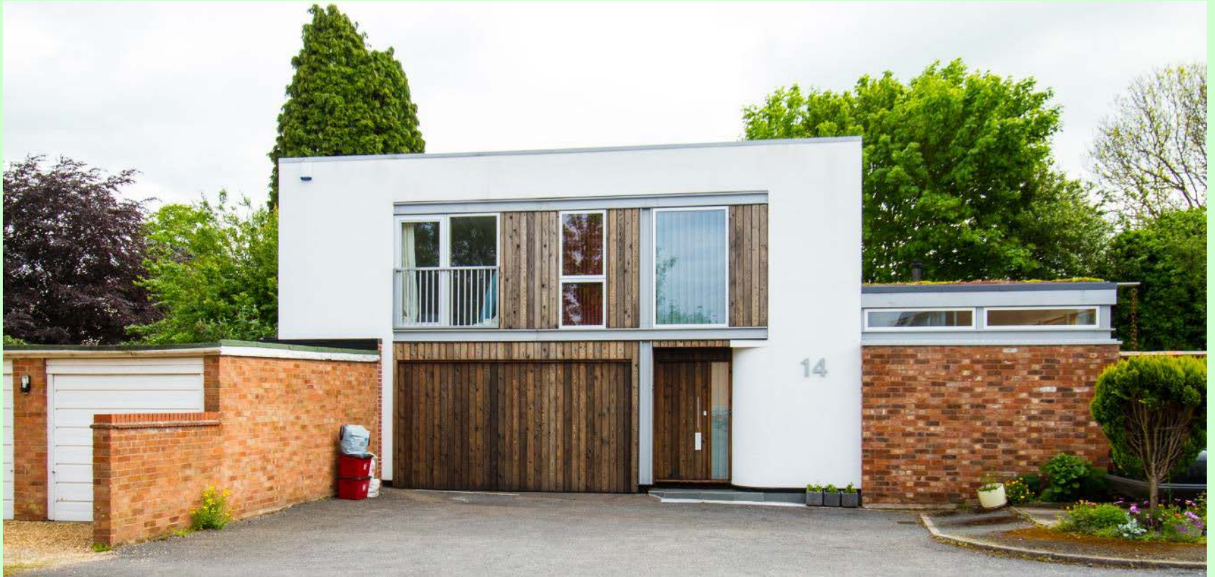
14 Rotherfield Close