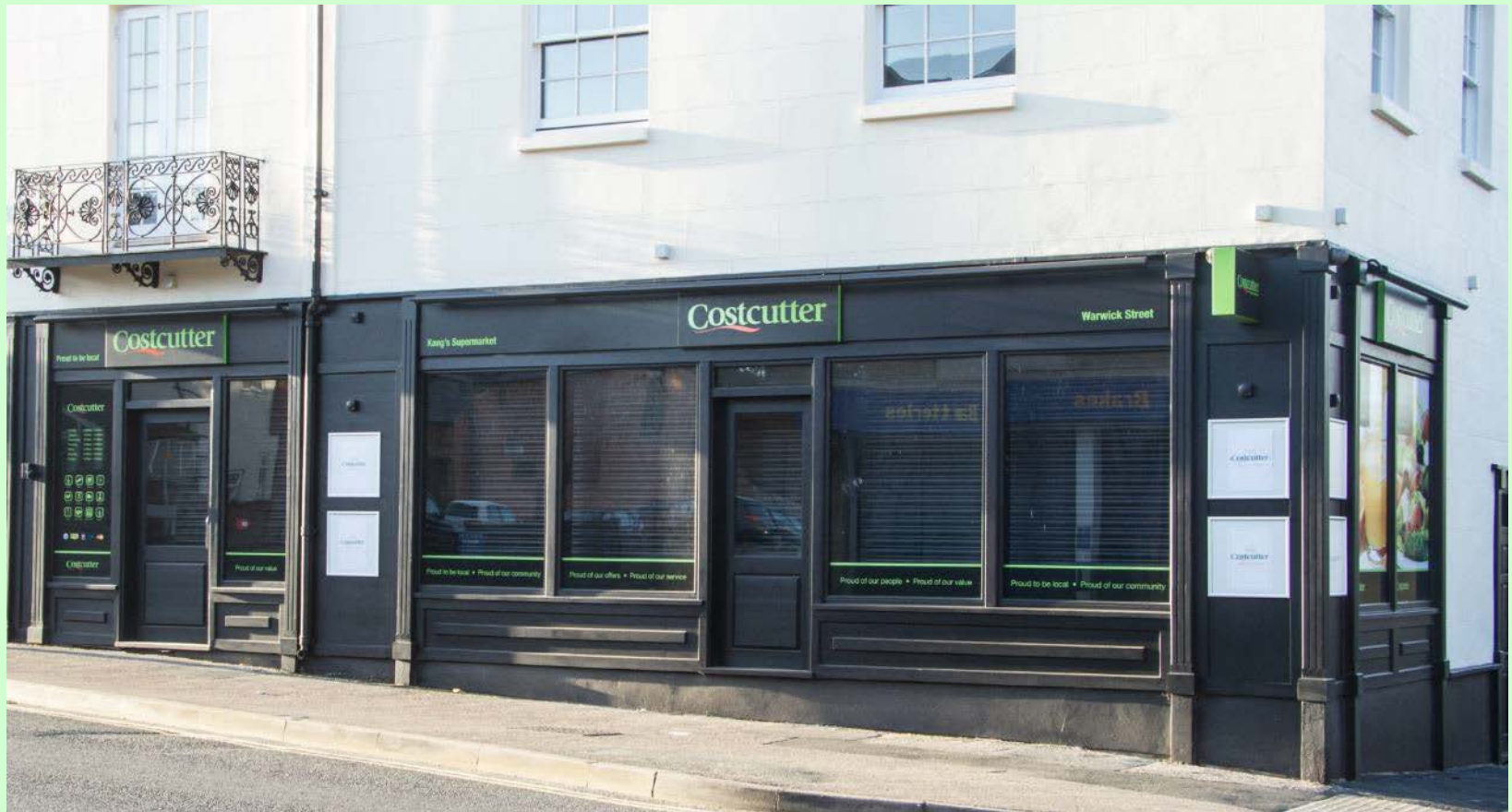
Kang's Costcutter, 16, 18 Warwick Street