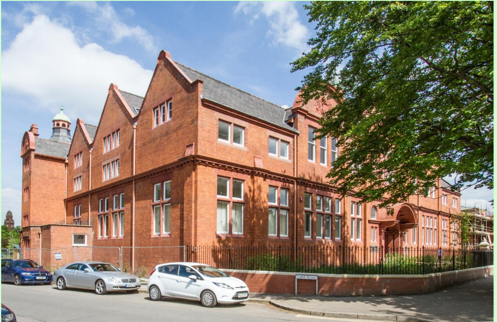
Old Library, Avenue Road