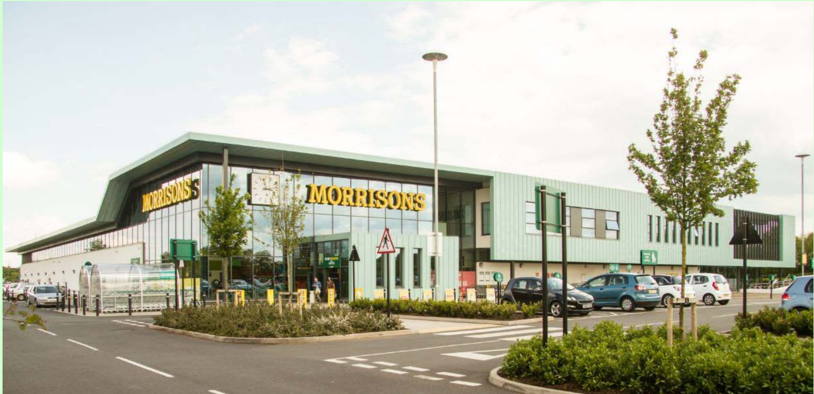
Morrisons Supermarket, Old Warwick Road