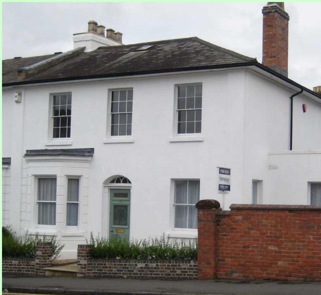
21 Beauchamp Hill