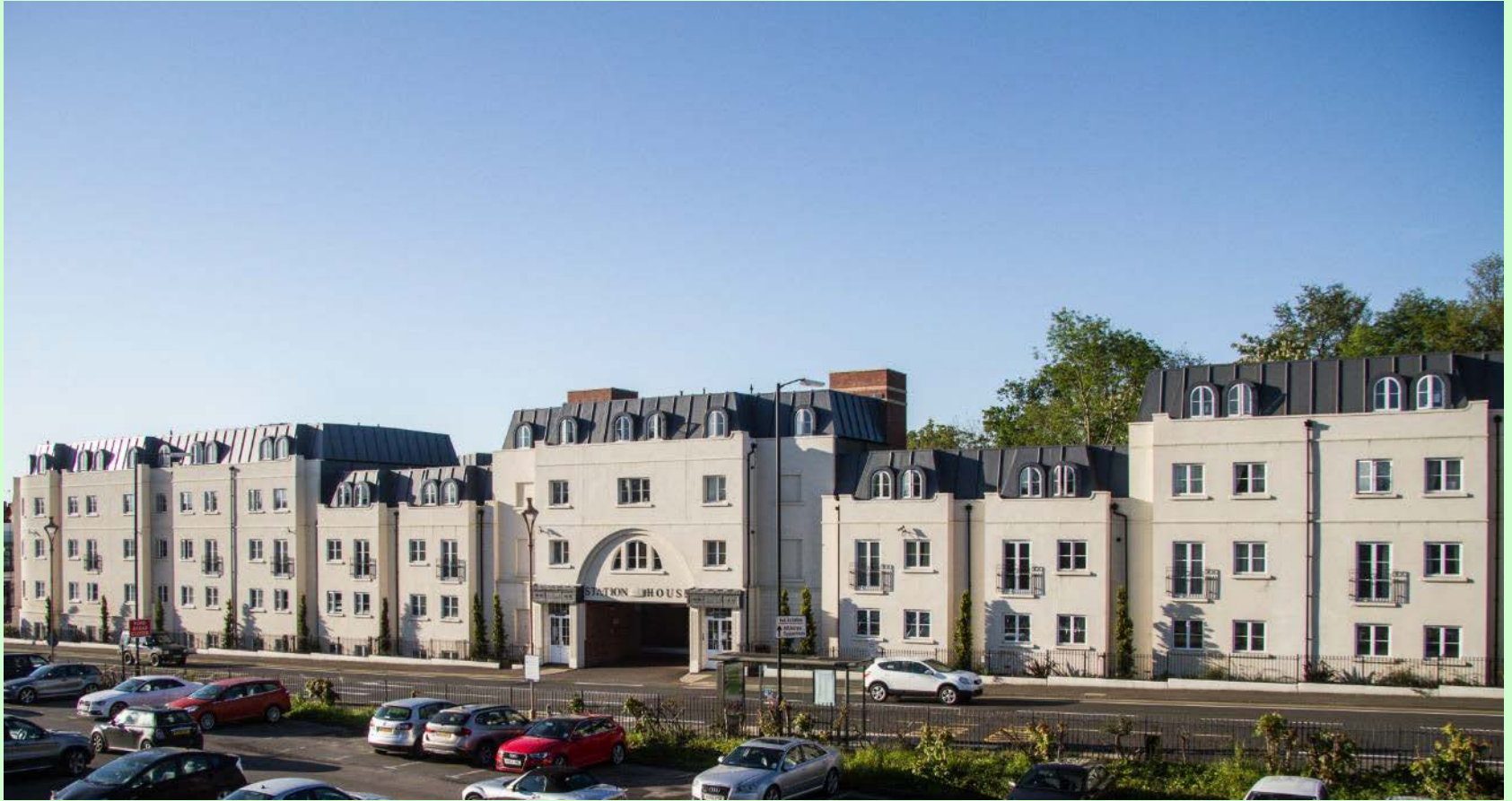
Station House, Old Warwick Road