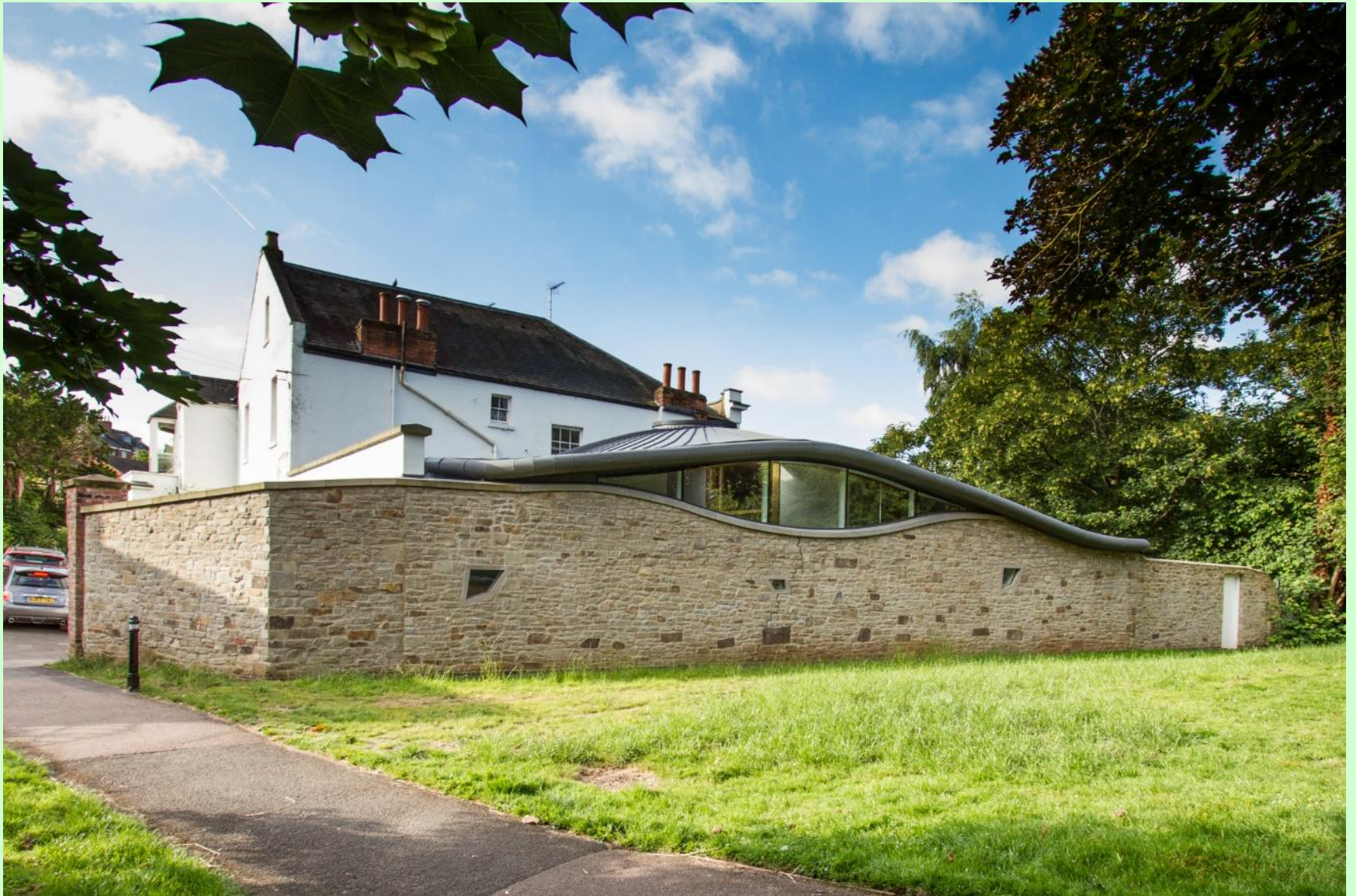
9 Clarendon Crescent