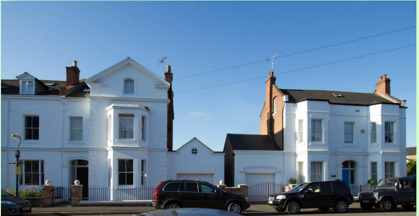
76 and 78 Leam Terrace