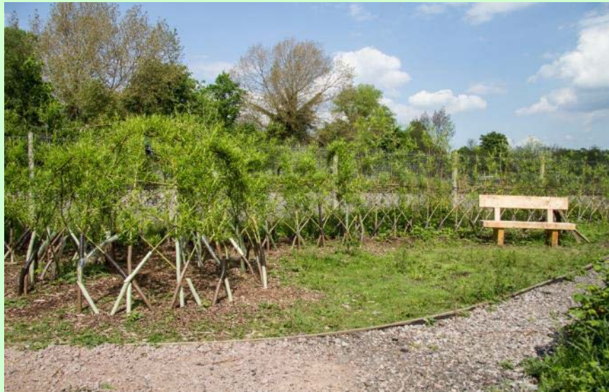
Foundry Community Wood, Prince's Drive