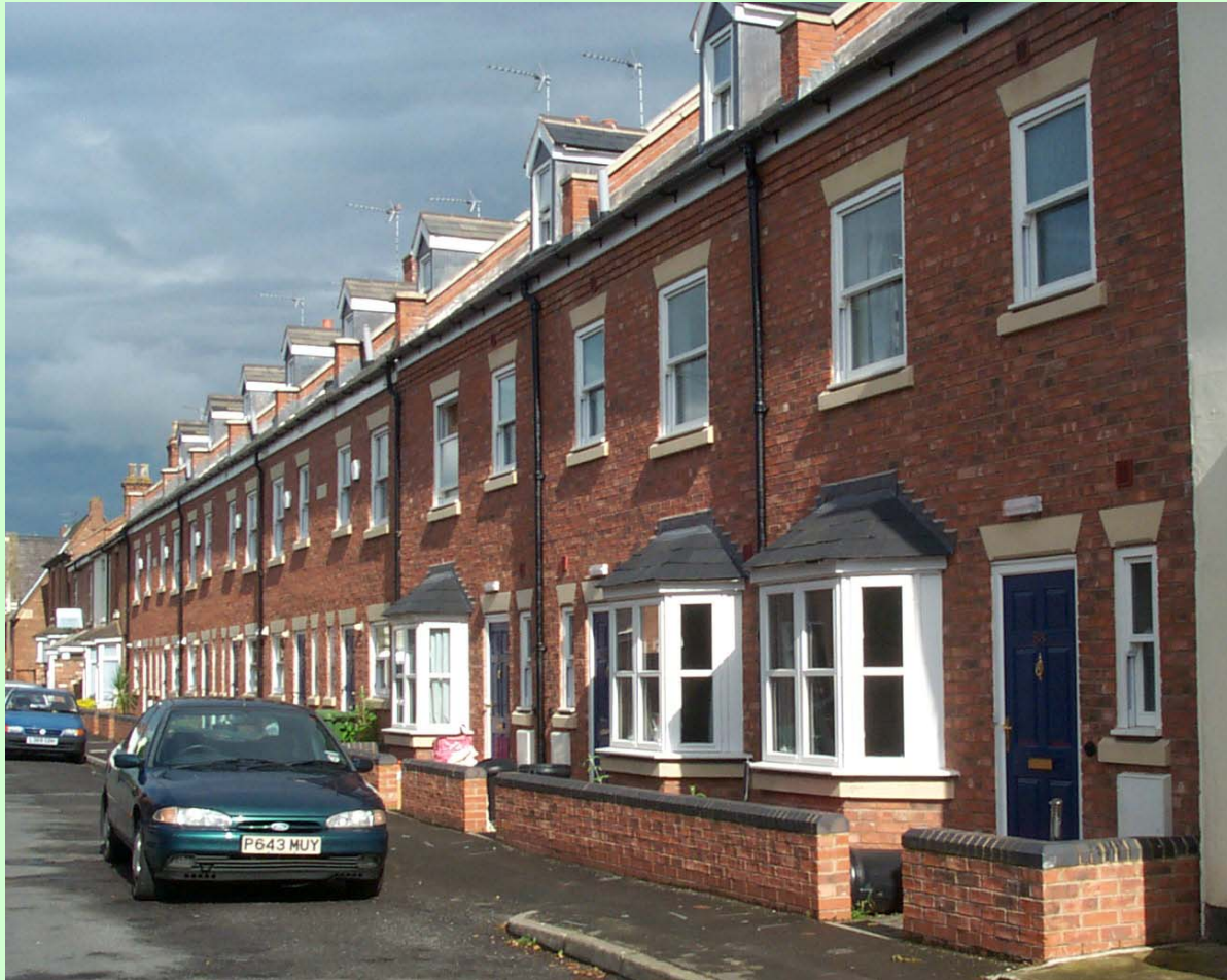
88, 88A and 88B New Street, with bay windows