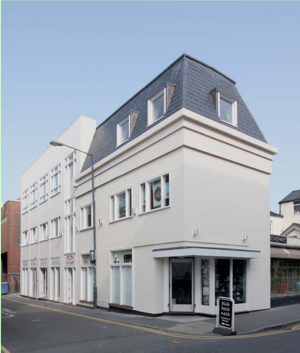
6 Bedford Street