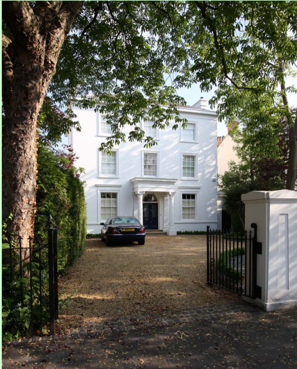
Florence House, 39 Leam Terrace