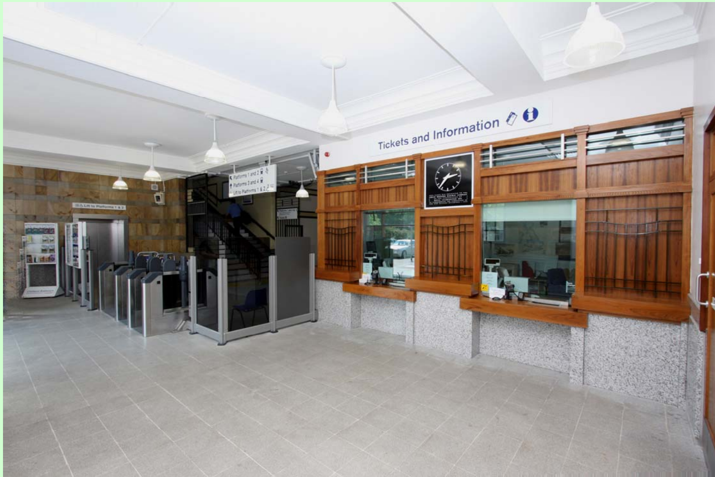
Leamington Spa railway ticket hall