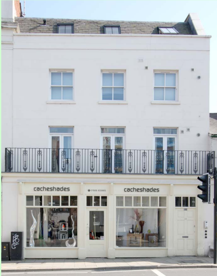
Lancaster House, 10 Spencer Street