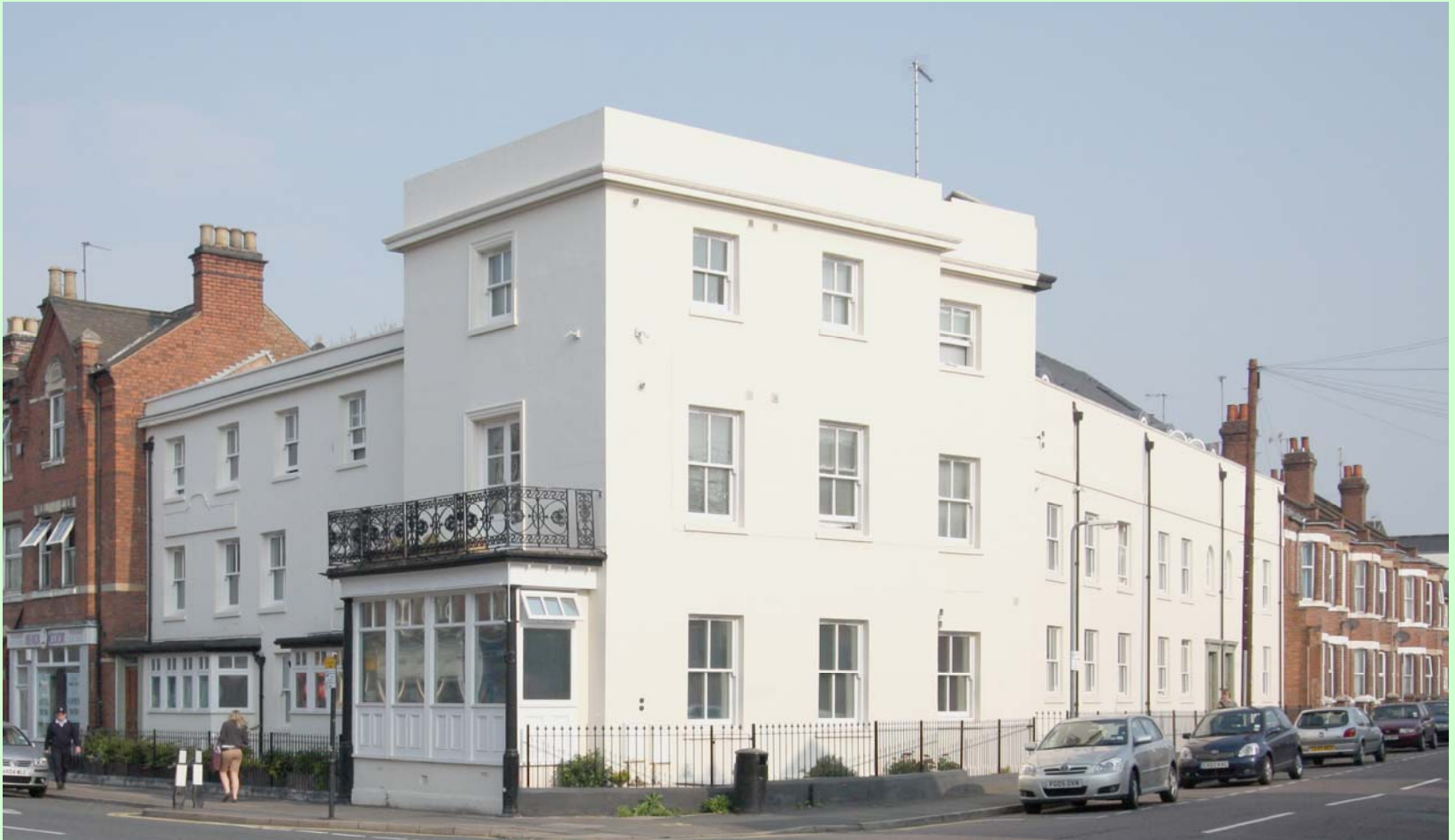
Former George Hotel, Renovated and extended