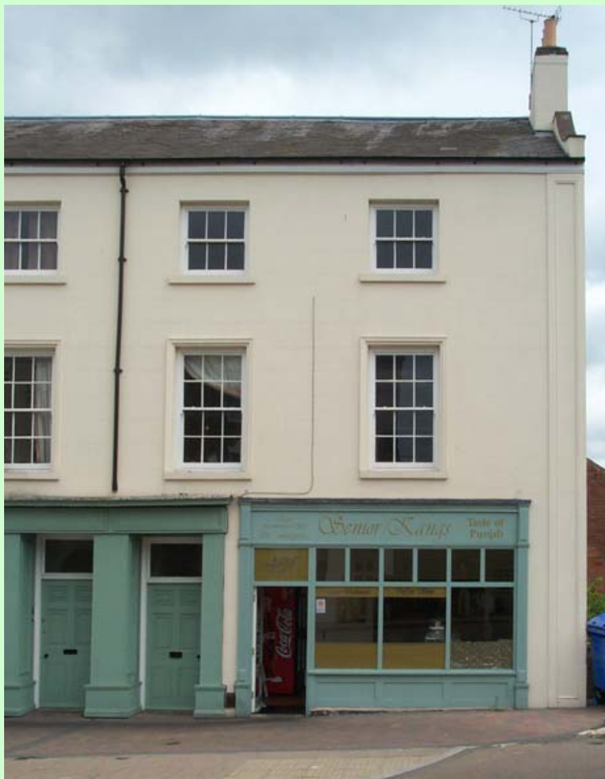
43 Clemens Street