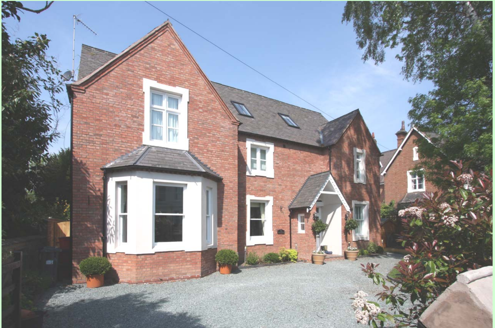
2A Eastnor Grove