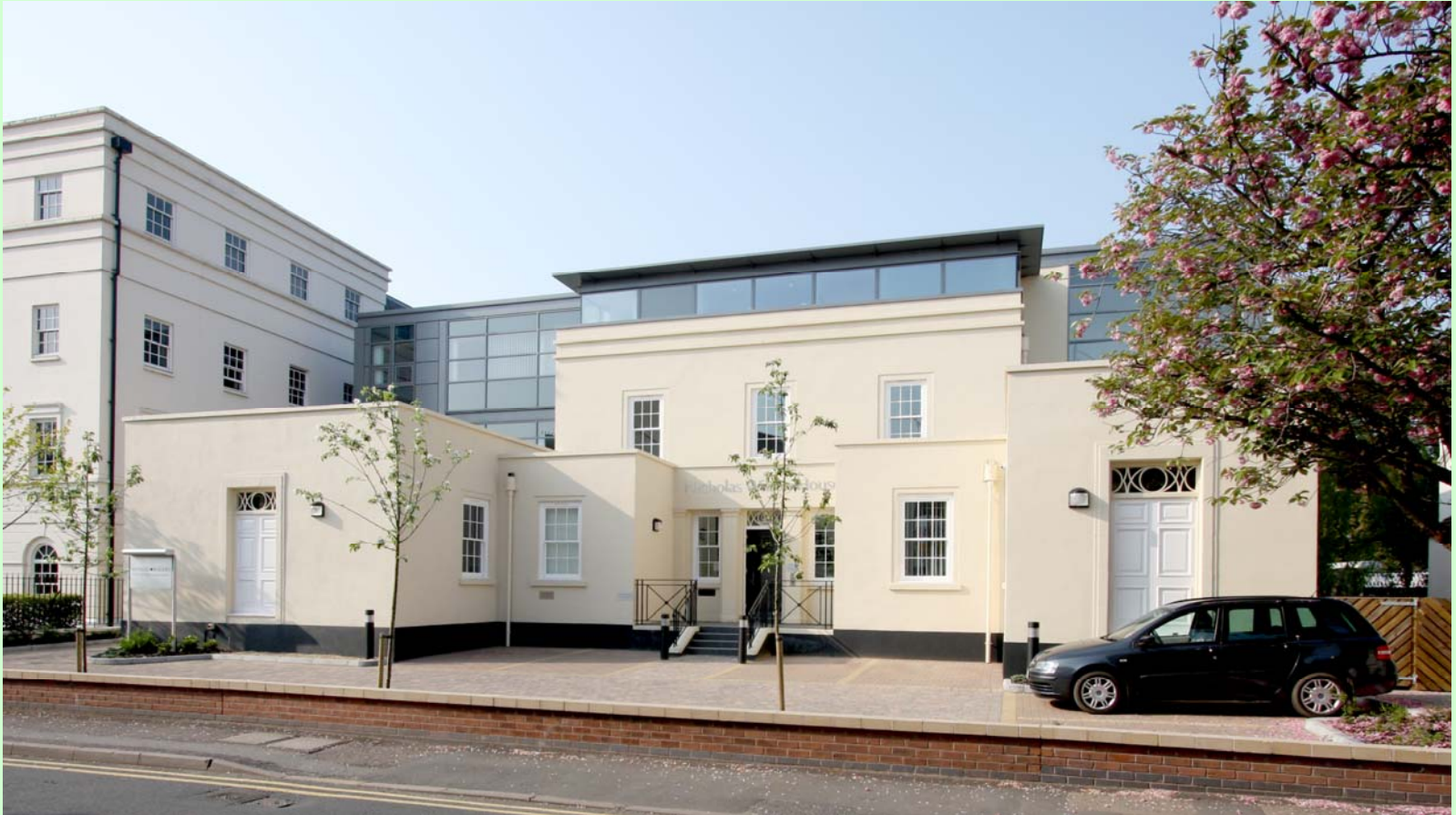
Nicholas Wilson House, Dormer Place