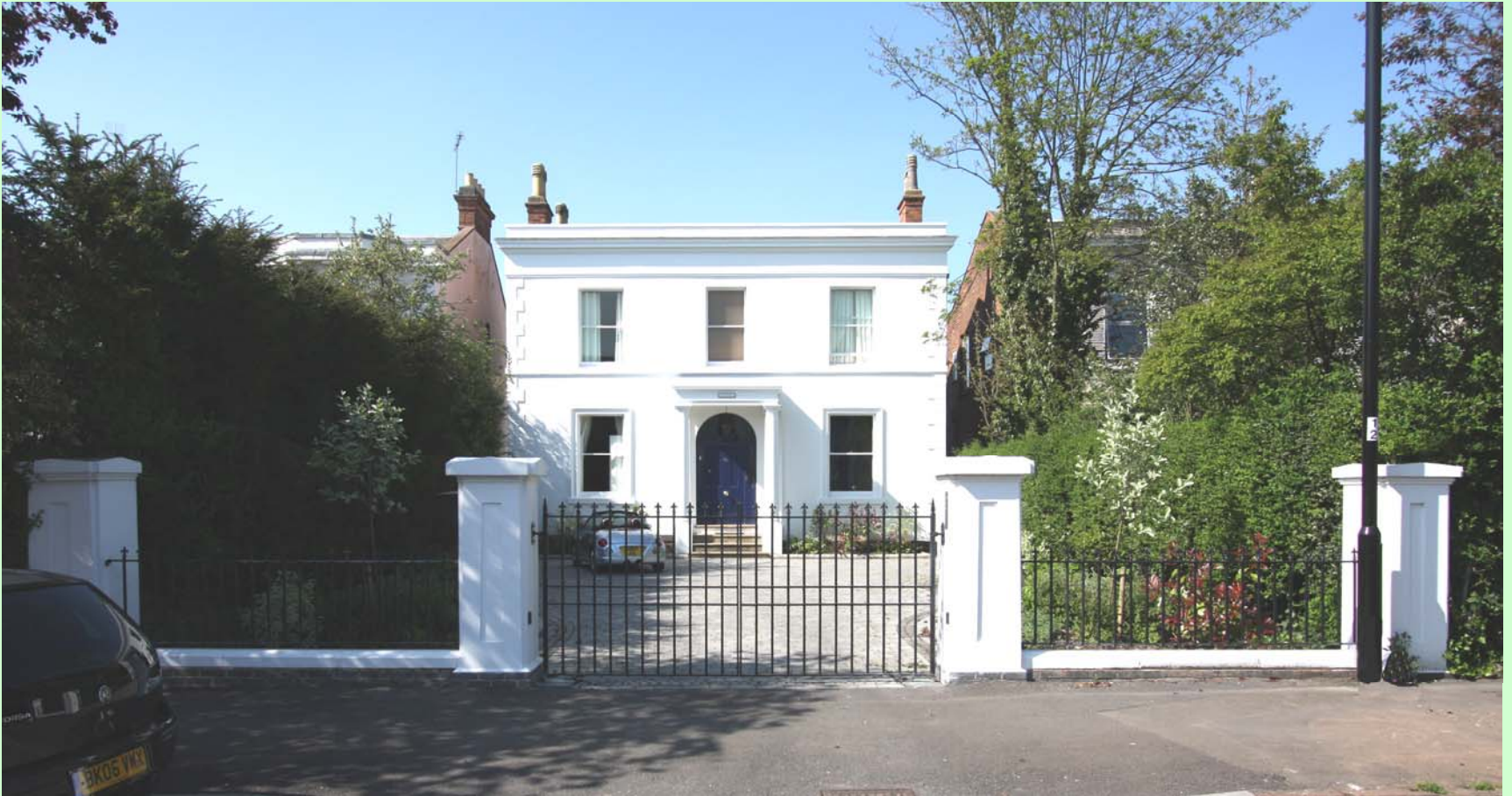
The White House 45 Leam Terrace