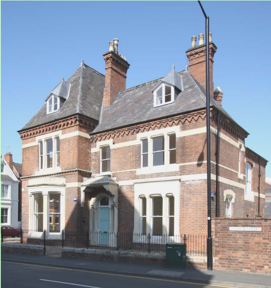
Priory House, 1 Church Street