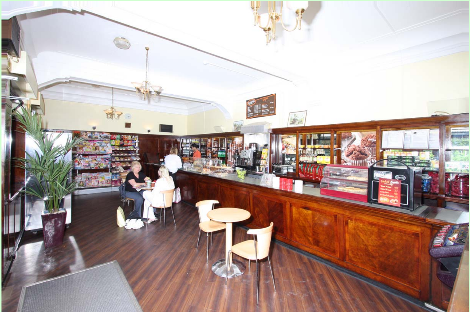
Pumpkin buffet on Platform 2, the railway station