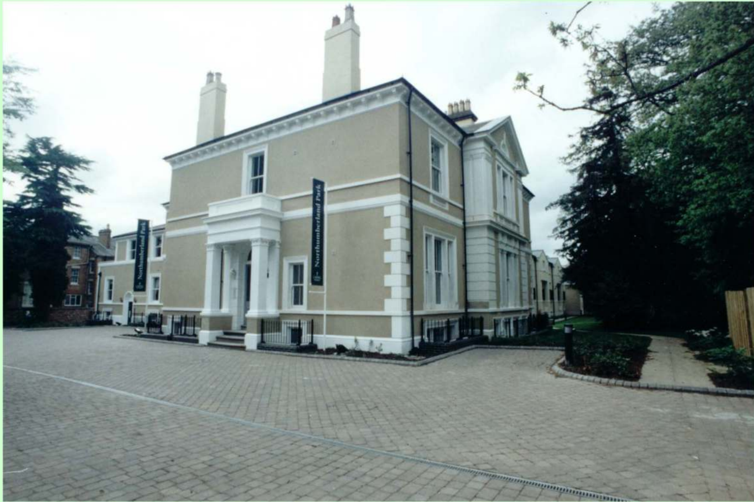
Northumberland Park (front view)