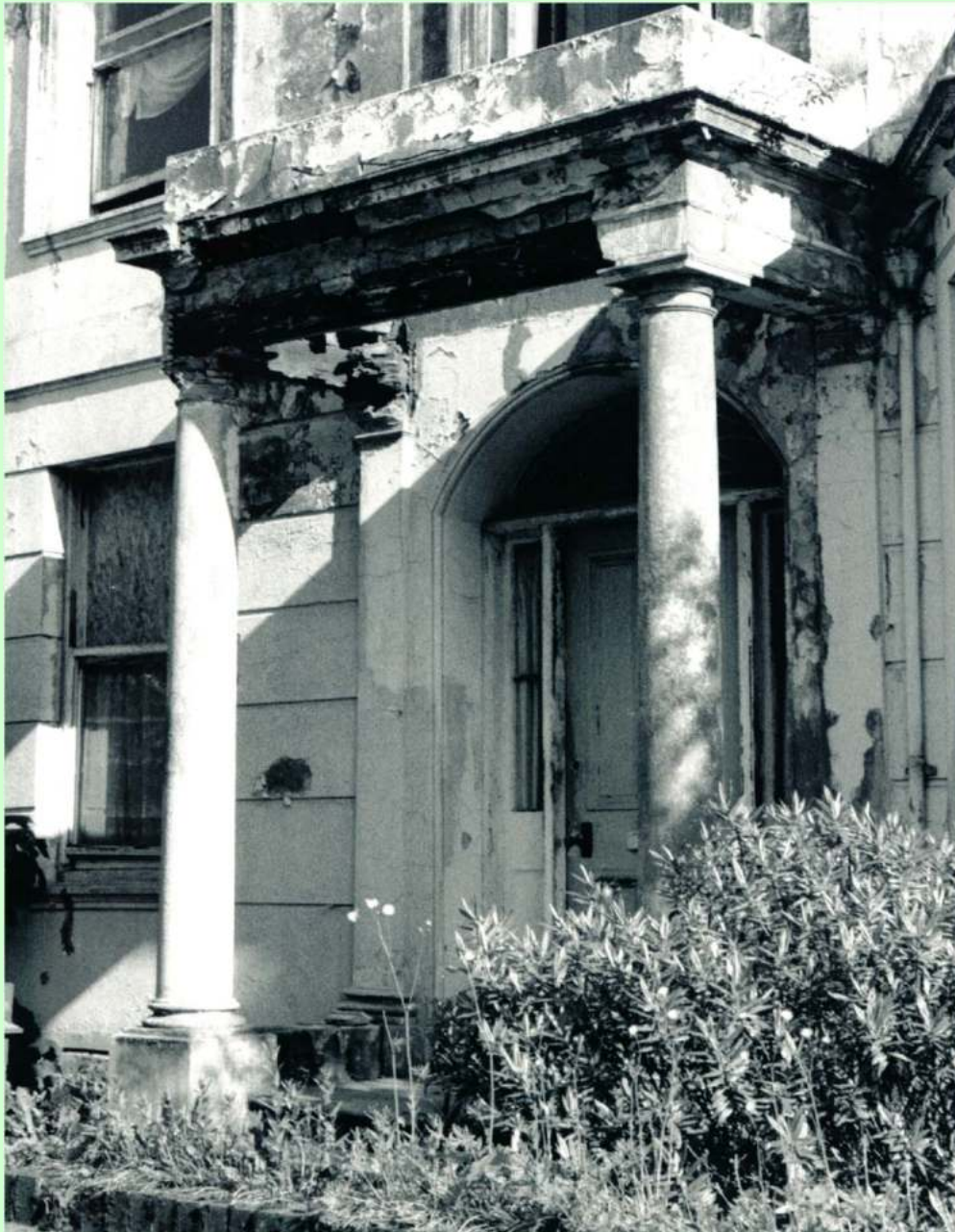
62 Leam Terrace the poor portico!