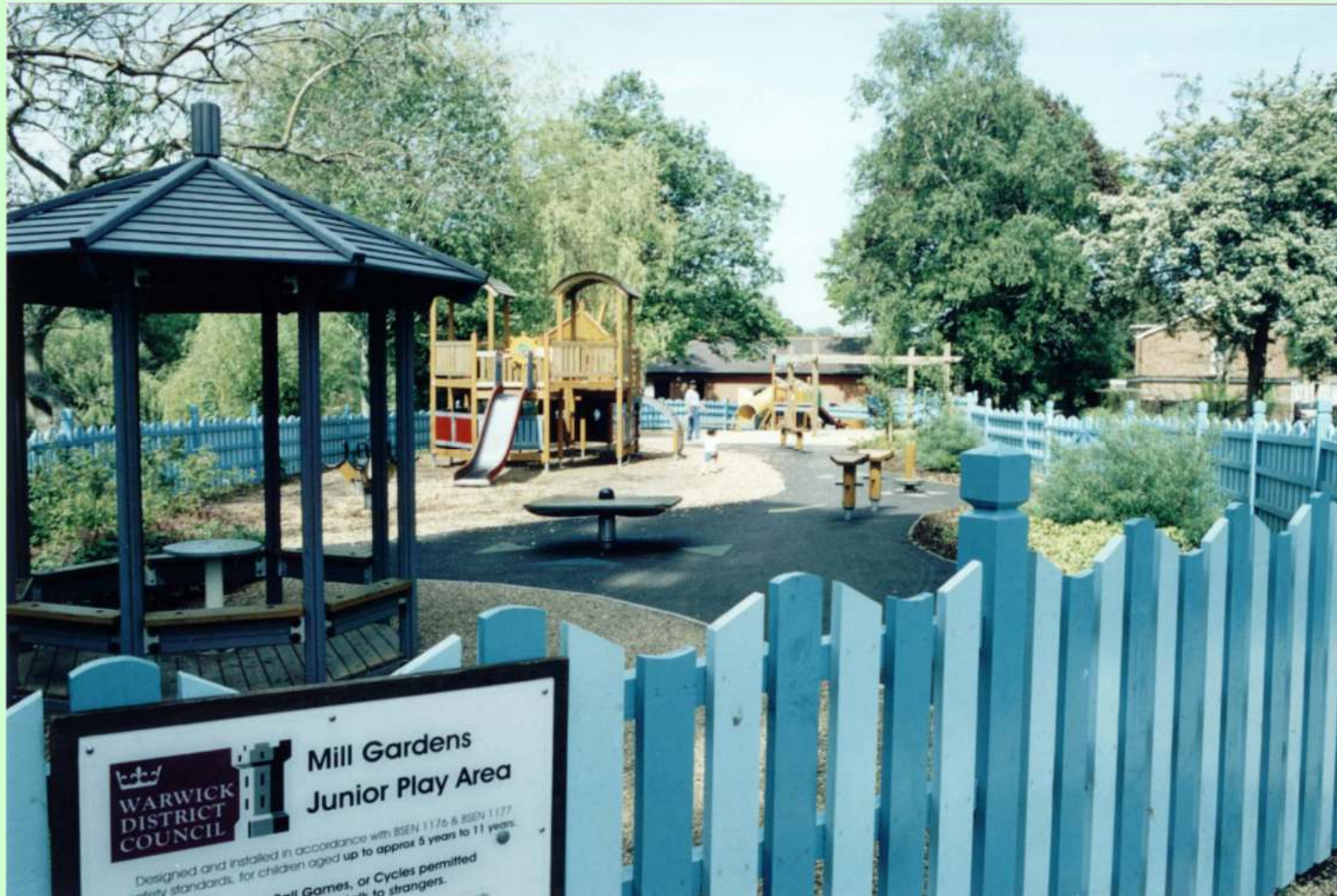
The Play Area, Jephson Gardens