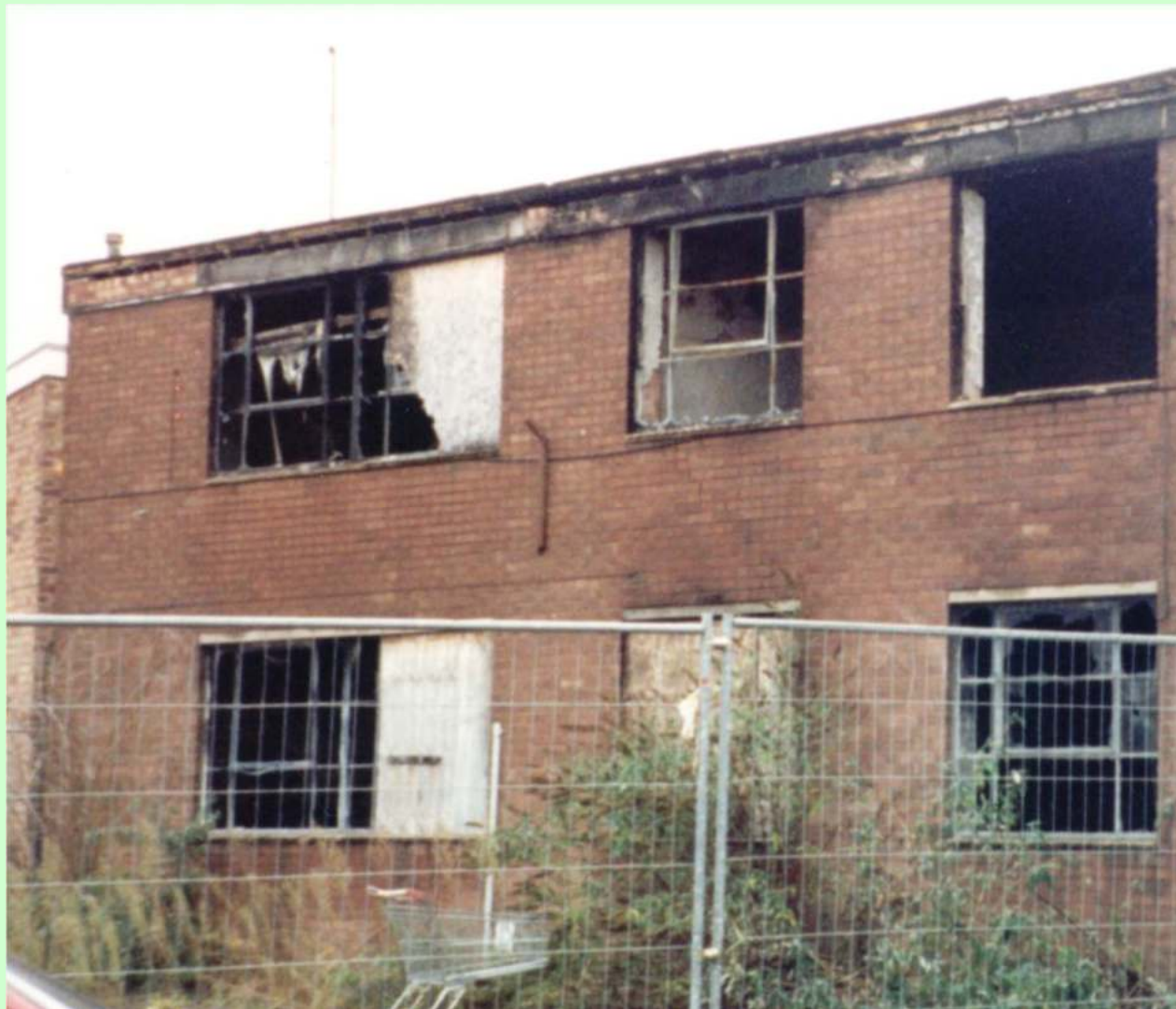
Unit 1 Althorpe Industrial Estate before!