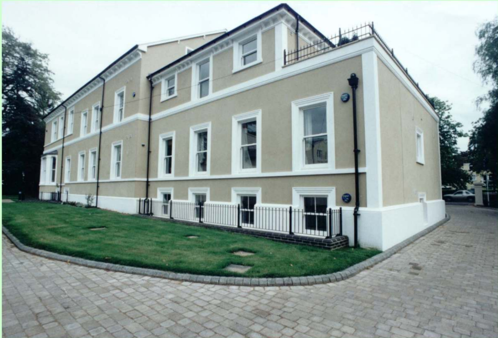
Northumberland Park (rear view)