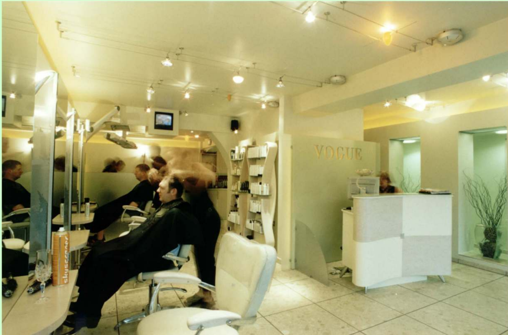
Vogue International (interior view)