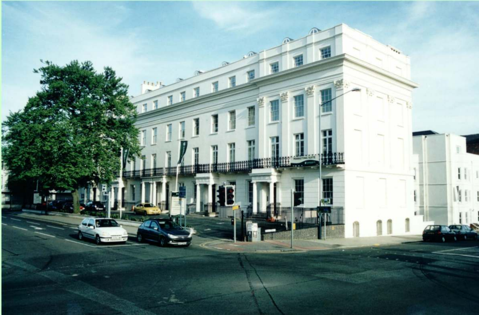
Clarence Mansions, Warwick Street