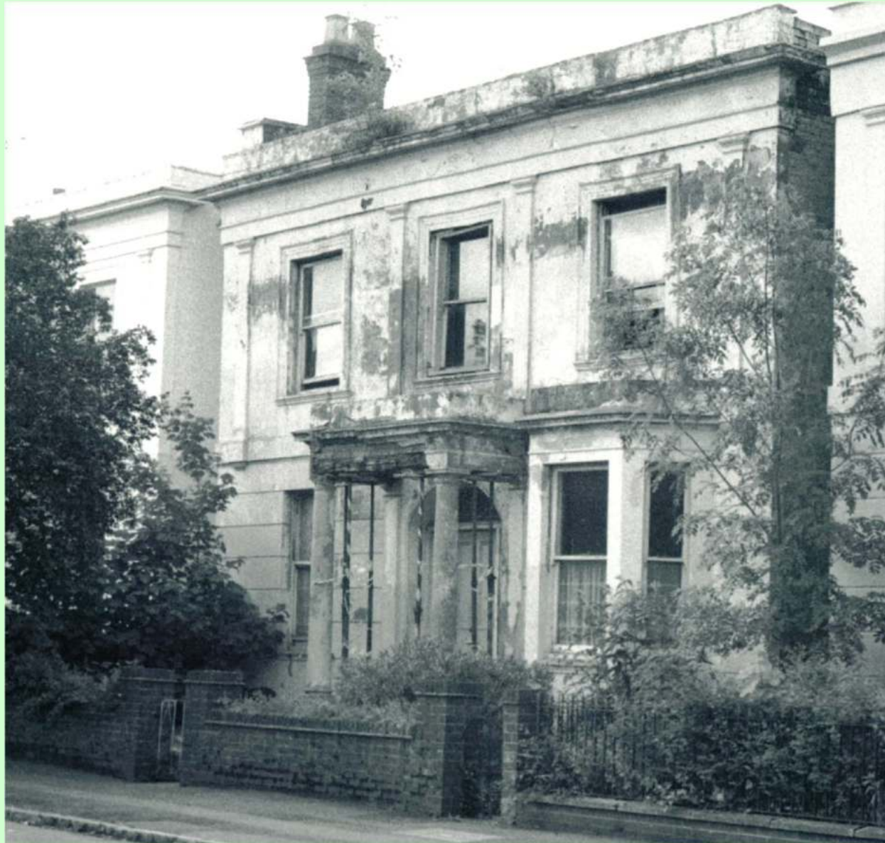
62 Leam Terrace - Before the Works