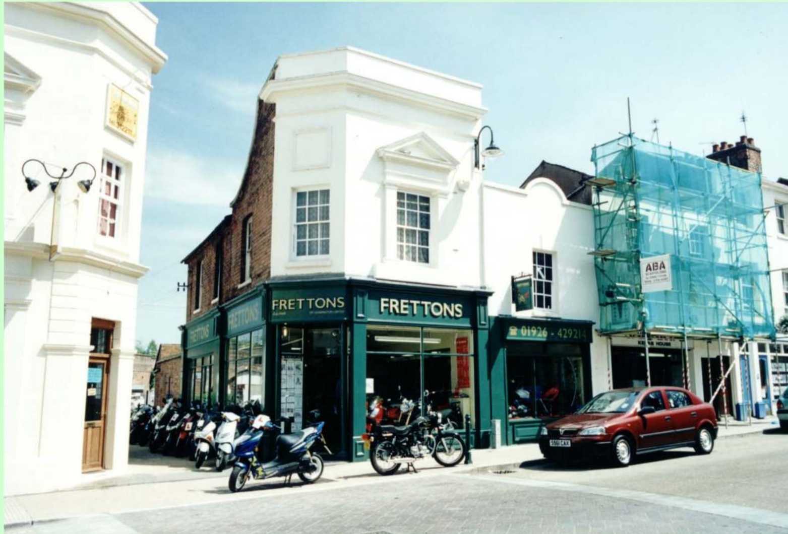
Frettons, 15 -17 Clemens Street