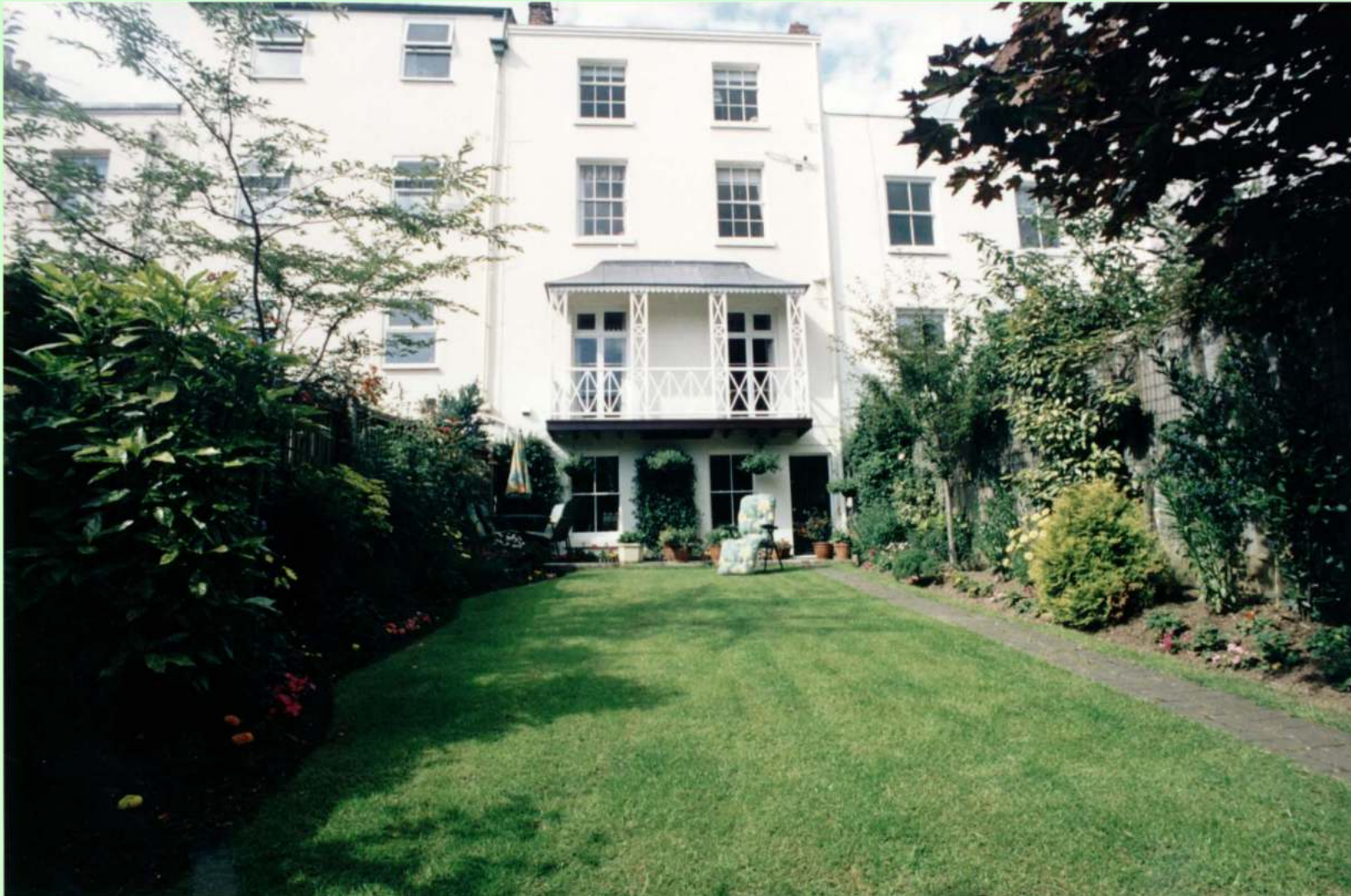
22 Portland Place - Rear Elevation