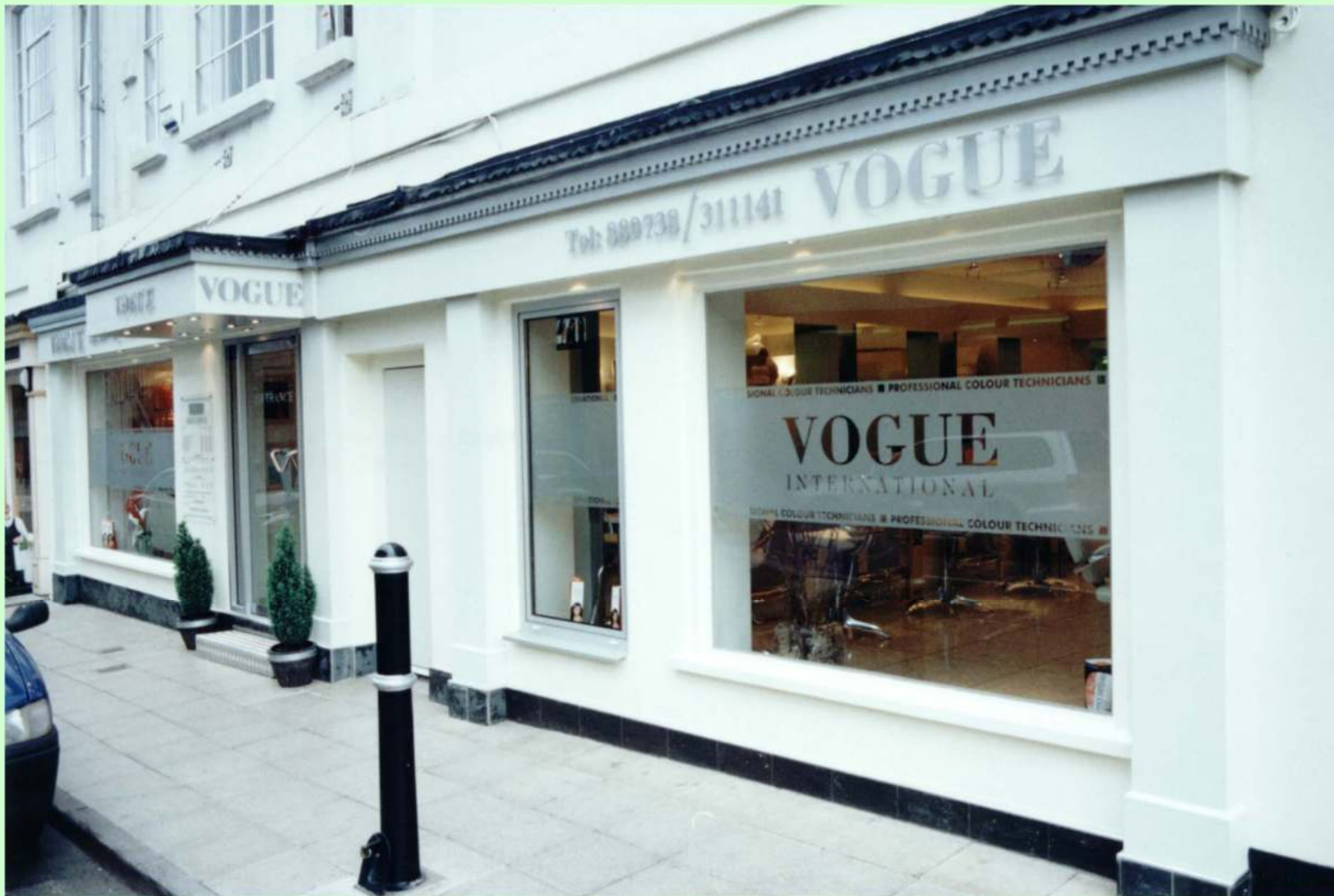
Vogue International 2 - 4 Tavistock St