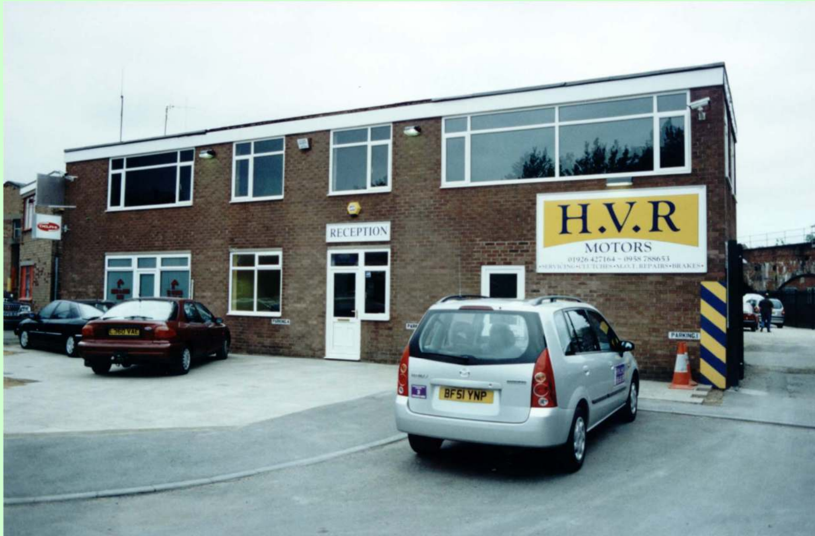
H.V.R Motors AFTER!!!!