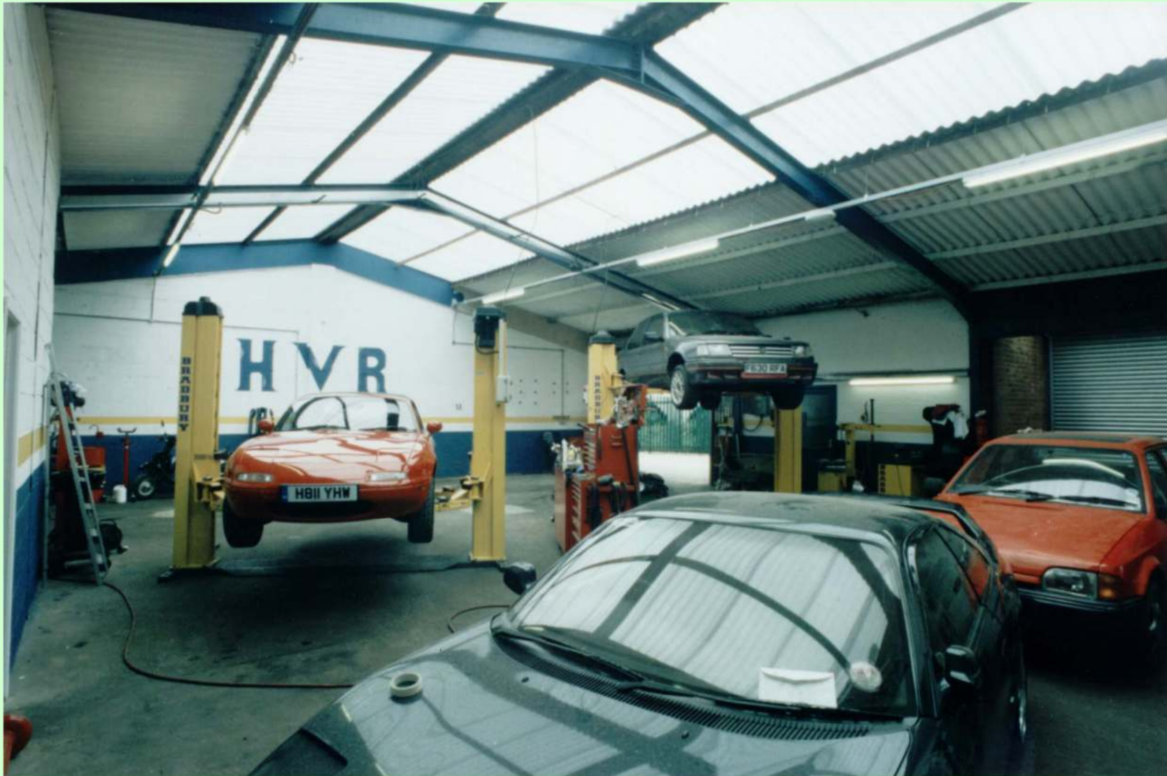
Interior of H.V.R