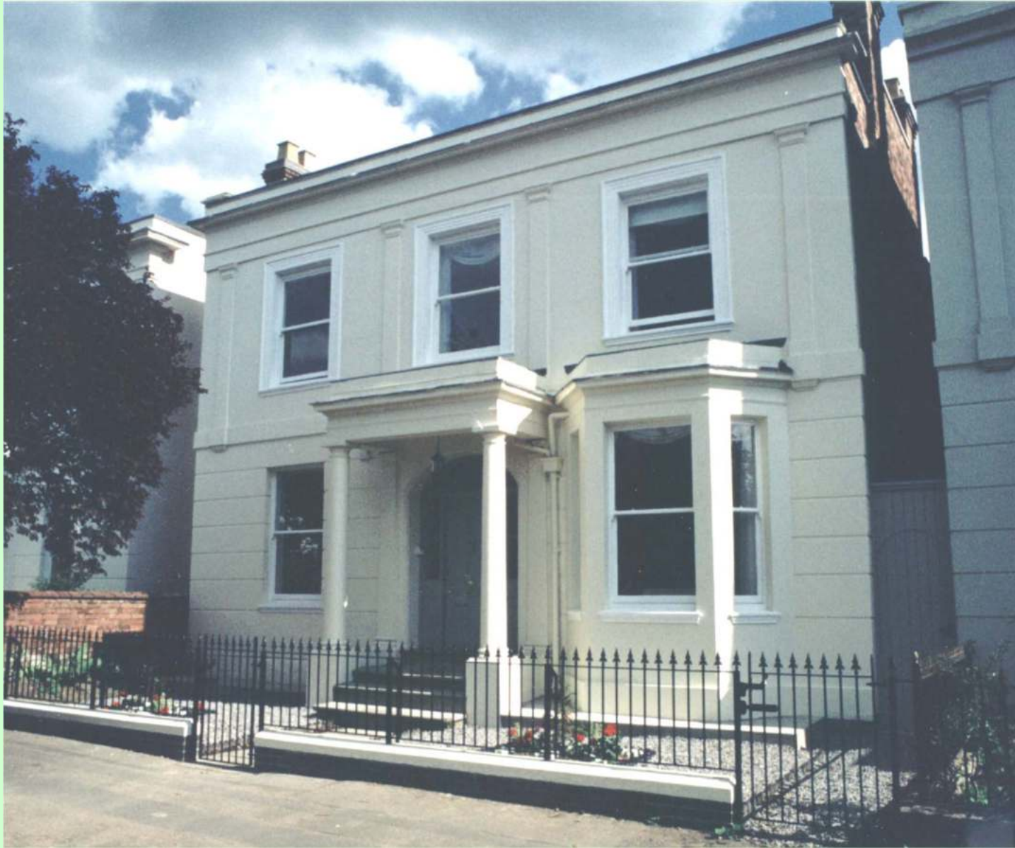
62 Leam Terrace - After!