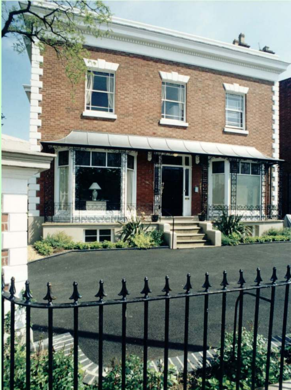
Kensington House, 15 St Mary's Road