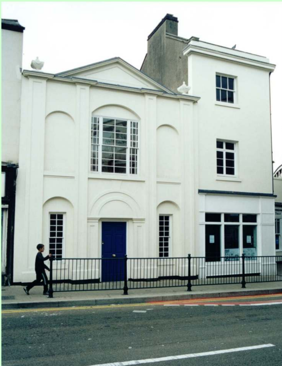
4 - 6 Clemens Street