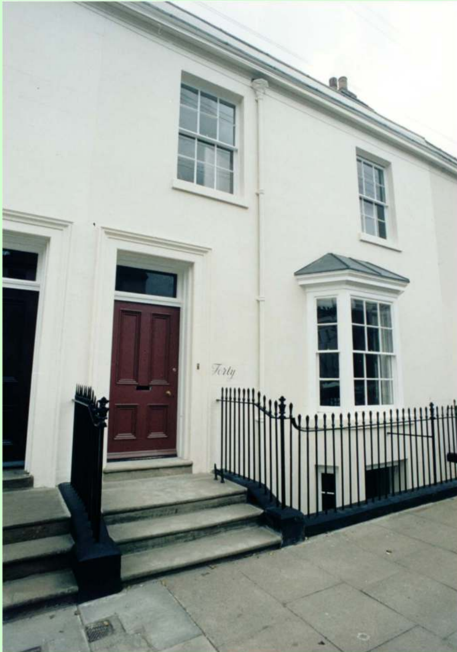
40 Portland Place East