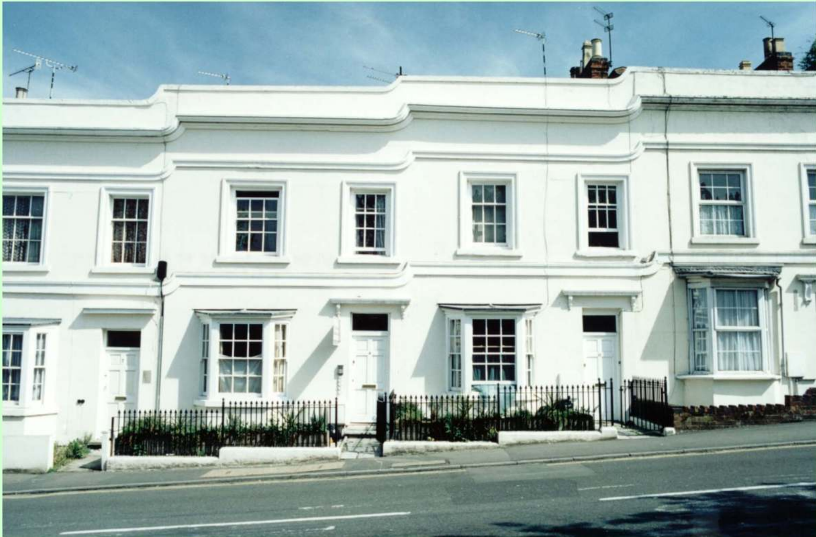
9 & 11 Tachbrook Road